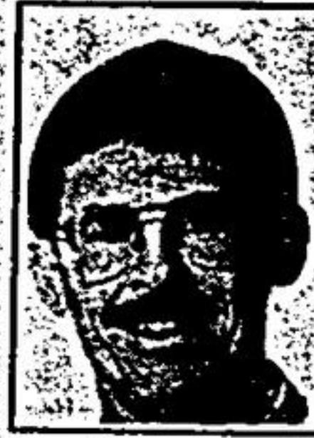
From Where I Live

Spectacular wipe outs were the order of the day, as organizers had hoped they would be. The most