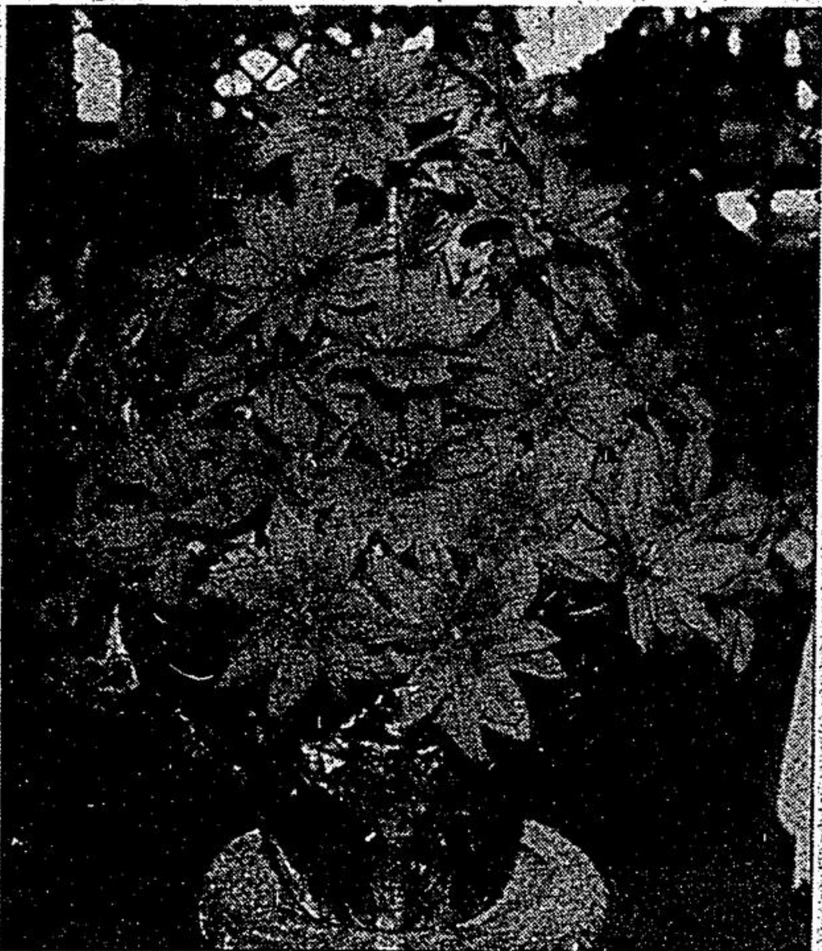
Plants make a wonderful gift for Christmas and with a little extra attention, they can last much past the holiday season.

CHRISTMAS CACTUS - Another favorite; it boasts a mass of spectacular blooms, yet only demands a cool spot and watering when the compost dries out. With minimal effort it can also be coaxed into blooming again next Christmas.