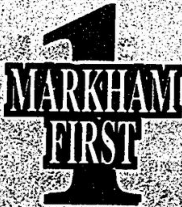
Mayor Frank Scarpitti

Authorized by the CFO for the Frank Scarpitti campaign