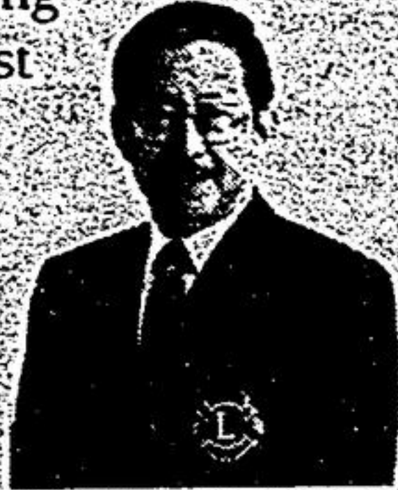
Recipient of Commemorative Medal for the 125th Anniversary of the Confederation Of Canada in recognition of significant contribution to compatriots, community and to Canada.