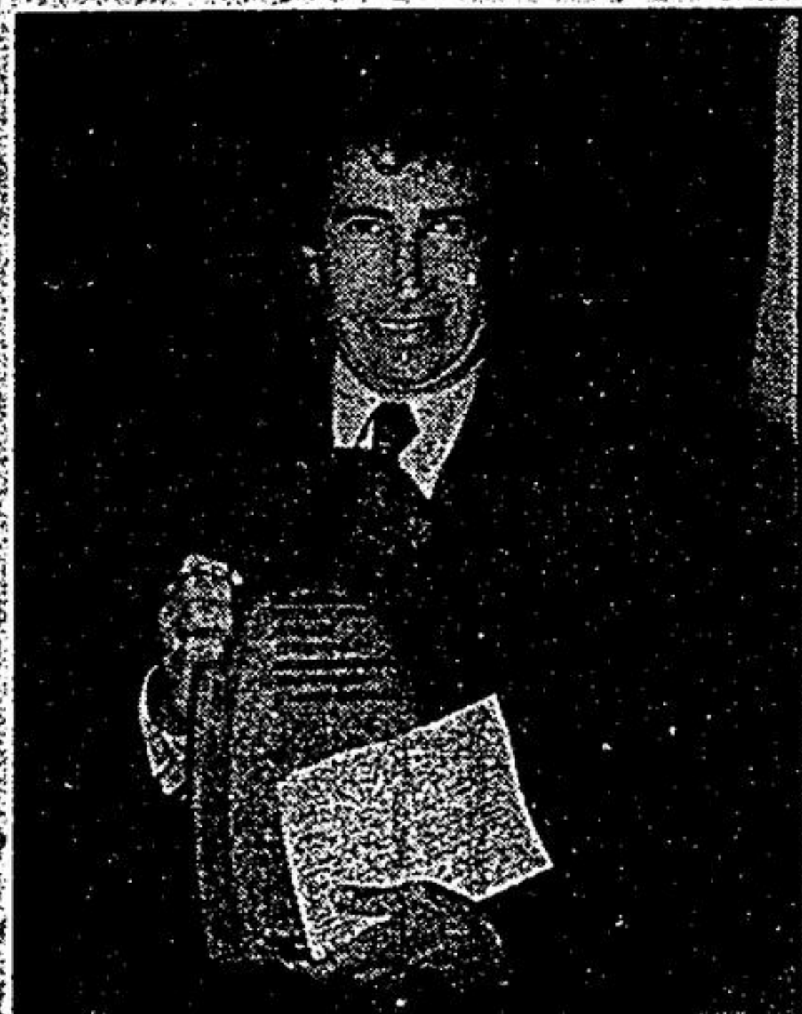
HUMMINGBIRD COMMUNICATIONS INC. for Extraordinary Business Achievement Award Sponsored by: The Markham Board of Trade