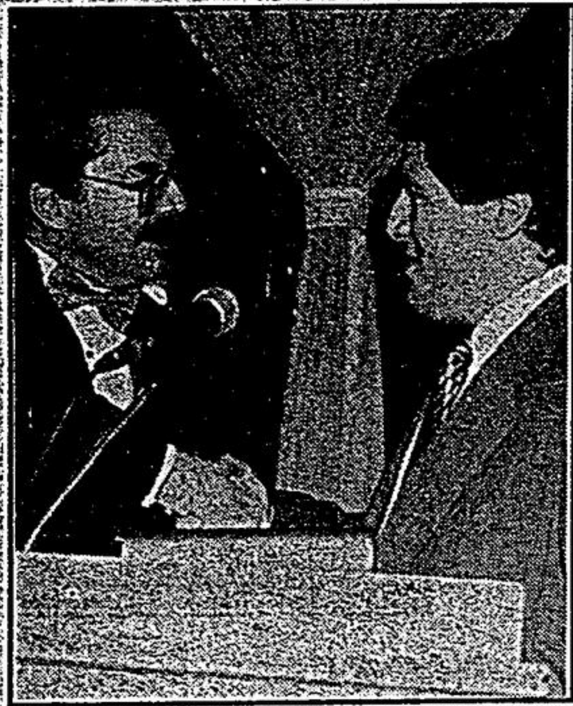
CABLETEST INTERNATIONAL INC. for International Award Sponsored by: The Markham Board of Trade

The Markham Board of Trade presented their Business Achievement Awards to 5 local companies to publicly recognize their achievements over the past year.