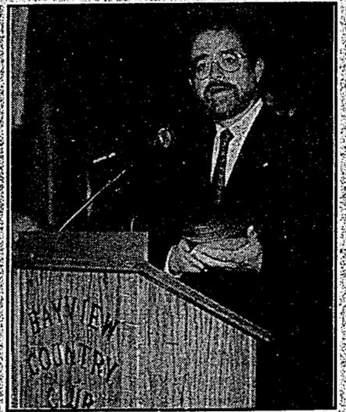
CLASSIC COMMUNICATIONS LTD. for Community Relations & Cultural Enrichment Award Sponsored by: Don Valley North Lexus Toyota