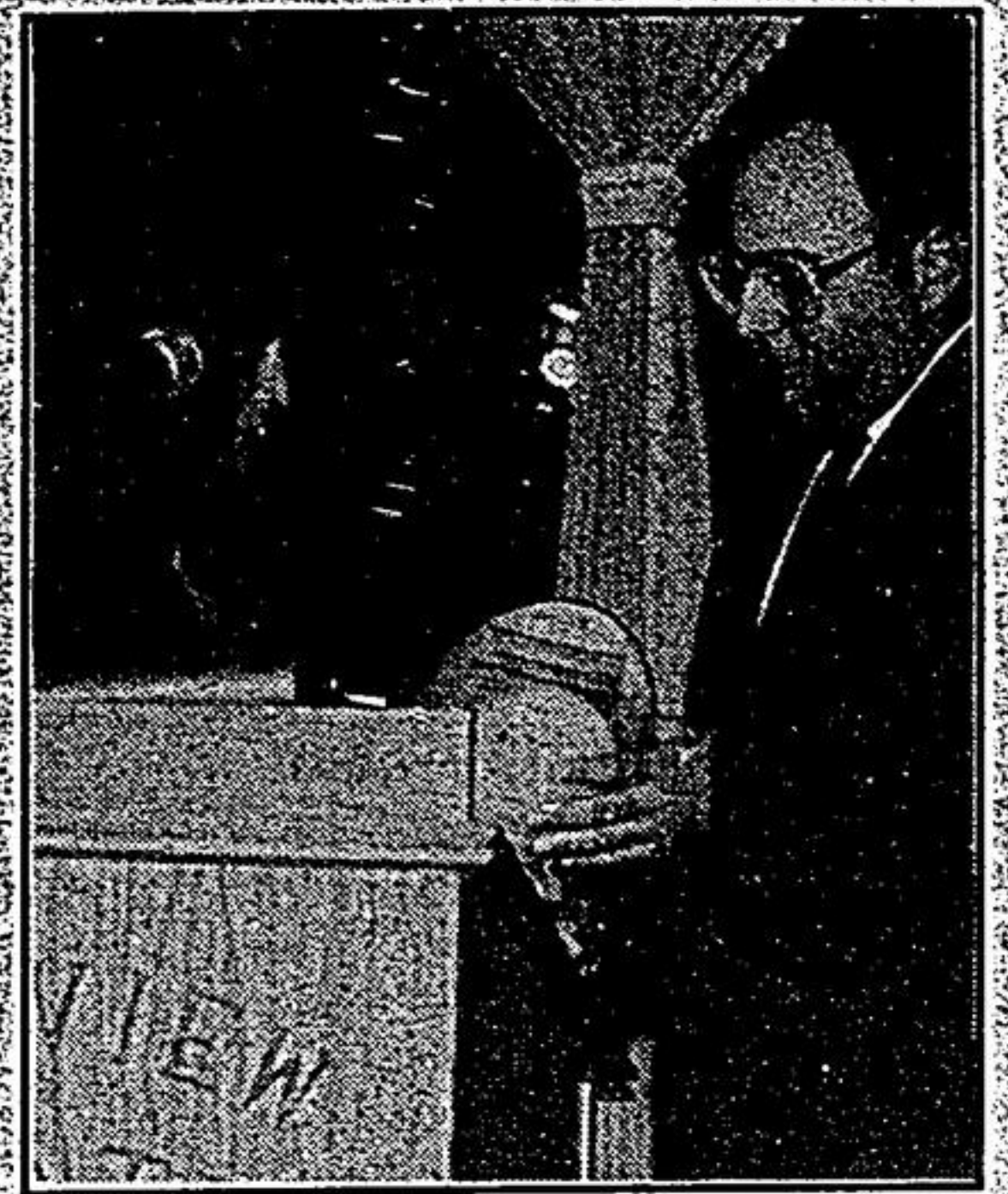
MOTORCYCLE TRAINING CONSULTANTS OF CANADA for Entrepreneurship & Innovation Award Sponsored by: Doane Raymond Chartered Accountants

To the Annual Awards and Dinner Committees and all who have contributed to the success of this program, our sincere thanks. Your commitment and support are truly appreciated.