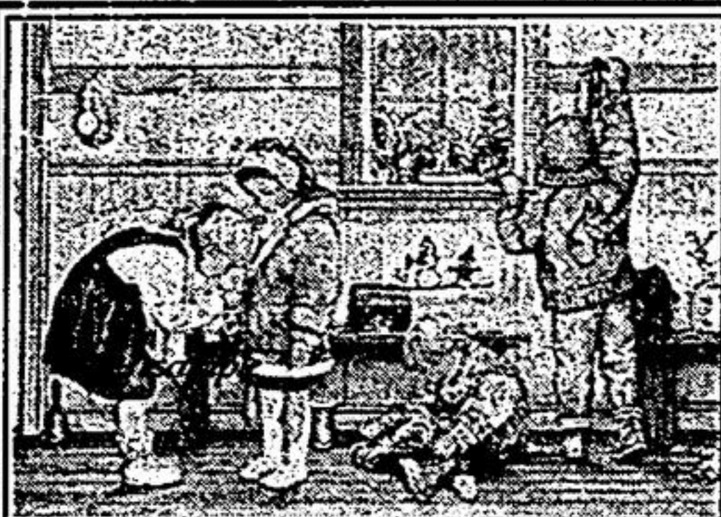
"Winter Recess" 10 1/2" x 15", 395 S/N $195