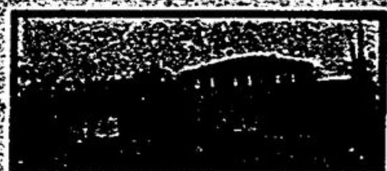
ESTATE HOME LOCATED ON 3/4 ACRE LOT

$289,500. Nicely appointed home with library, super country kitchen & finished basement, country living minutes from Markham. 1