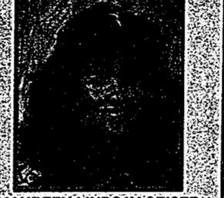
MAUREEN LINDSAY-GEISER* 294-1372