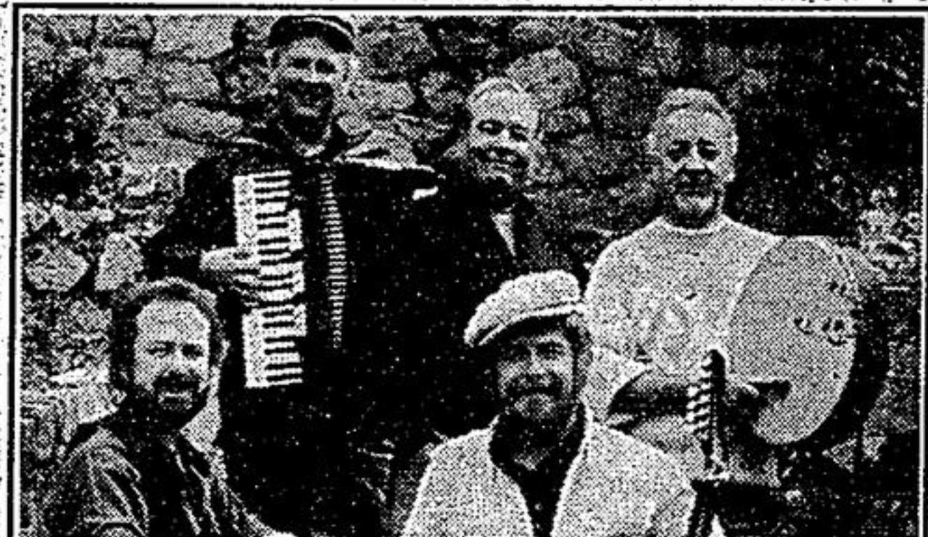
THE IRISH ROVERS • Oct. 4-6, 1993 • Sponsor - IBM Canada Ltd.

MUSIC SERIES I Subscribe for only $79.00