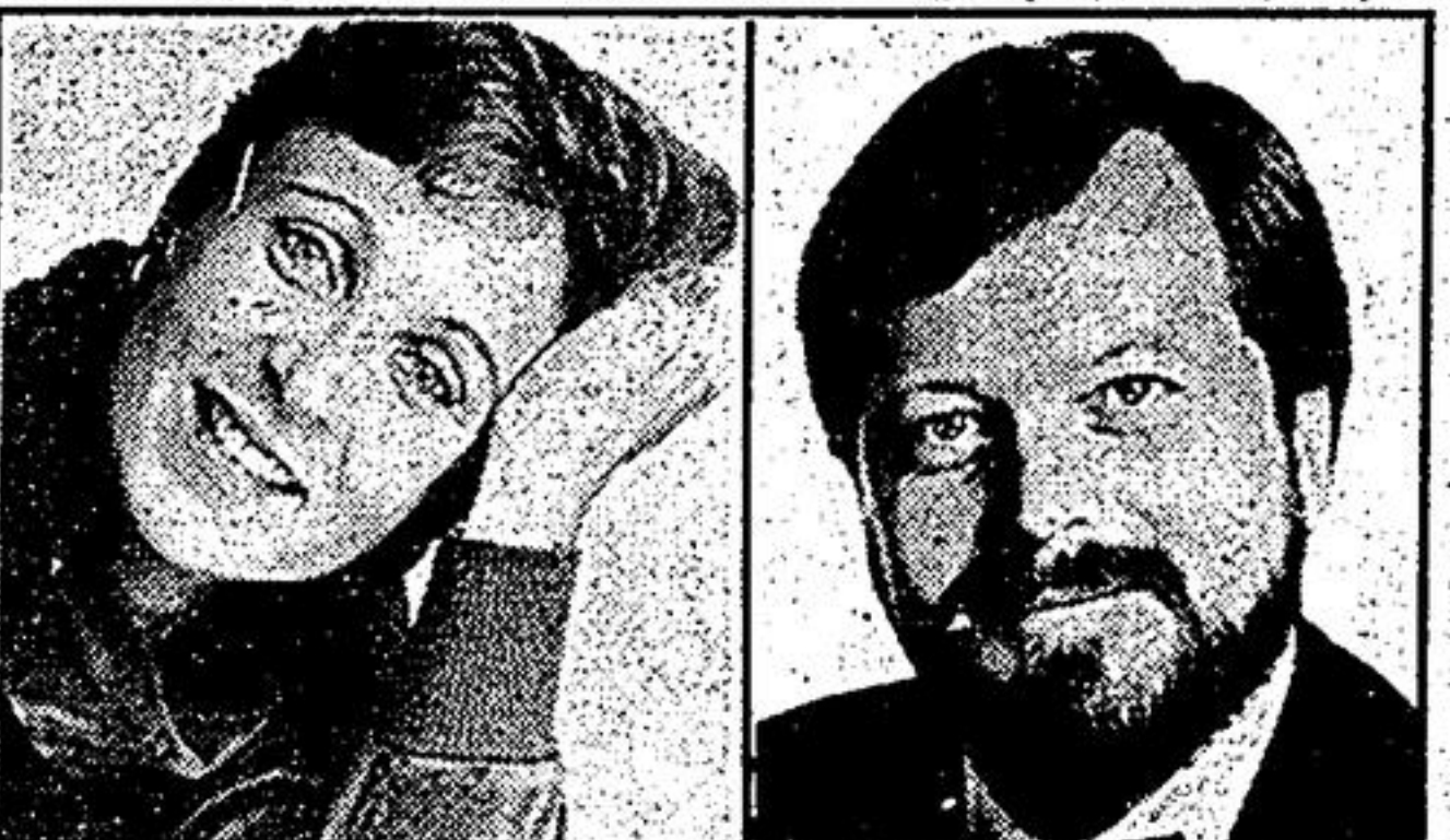
ANDREW LLOYD WEBBER: THE MAN & HIS MUSIC • Feb. 7-9, 1994 • Sponsor - Ainsworth