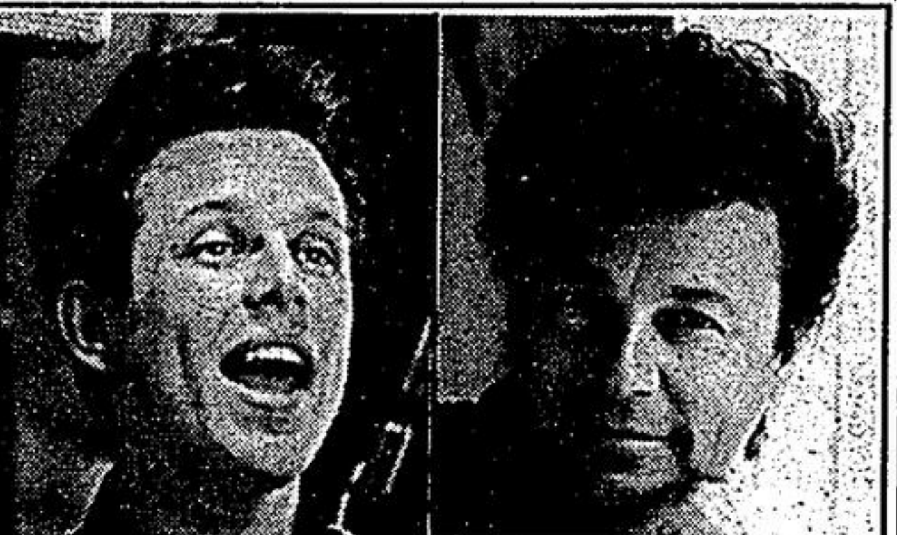
BOBBY CURTOLA • Feb. 10-12, 1994