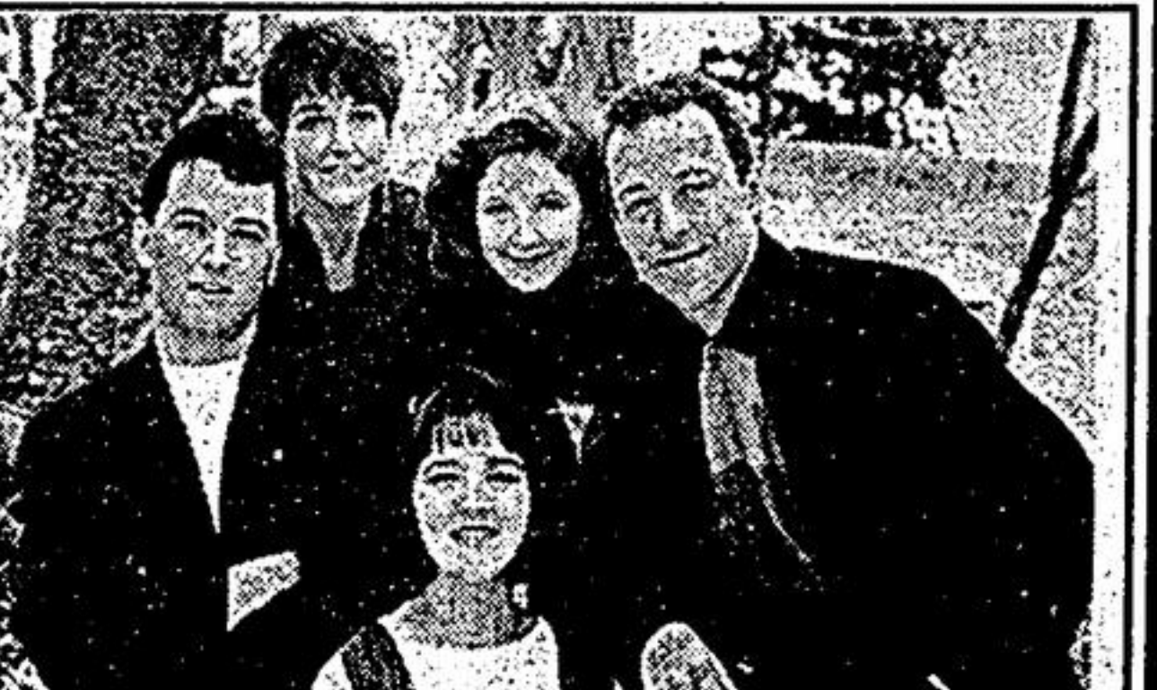
THE RANKIN FAMILY • Mar. 24-26, 1994 • Sponsor - Bull Information Systems

Call now for your free brochure and ask about our other subscription series - Theatre, Classical Music, Discovery, Dance, Family.