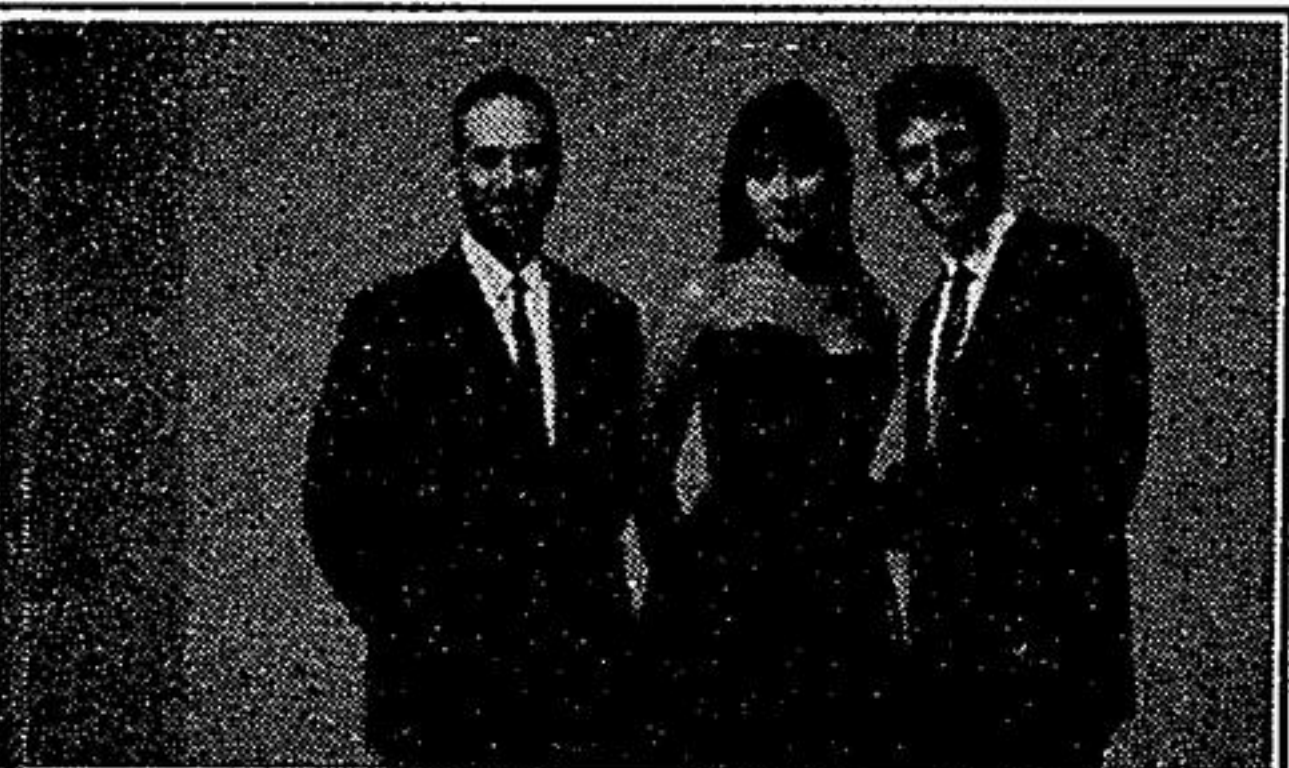
HOLLY COLE TRIO • Dec. 20-22, 1993 • Sponsor - First Professional Management