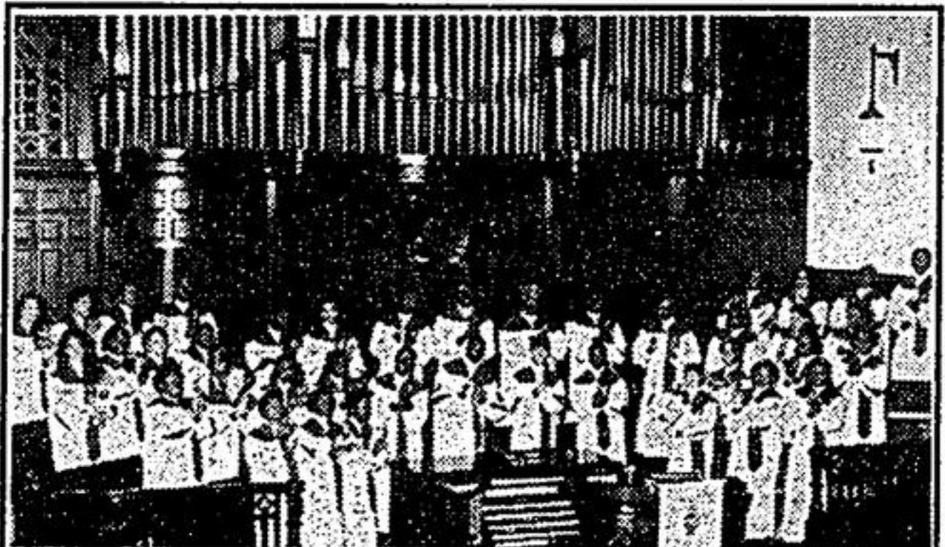
MONTREAL JUBILATION GOSPEL CHOIR • Dec. 2-4, 1993

Fantastic Savings 25% off regular prices