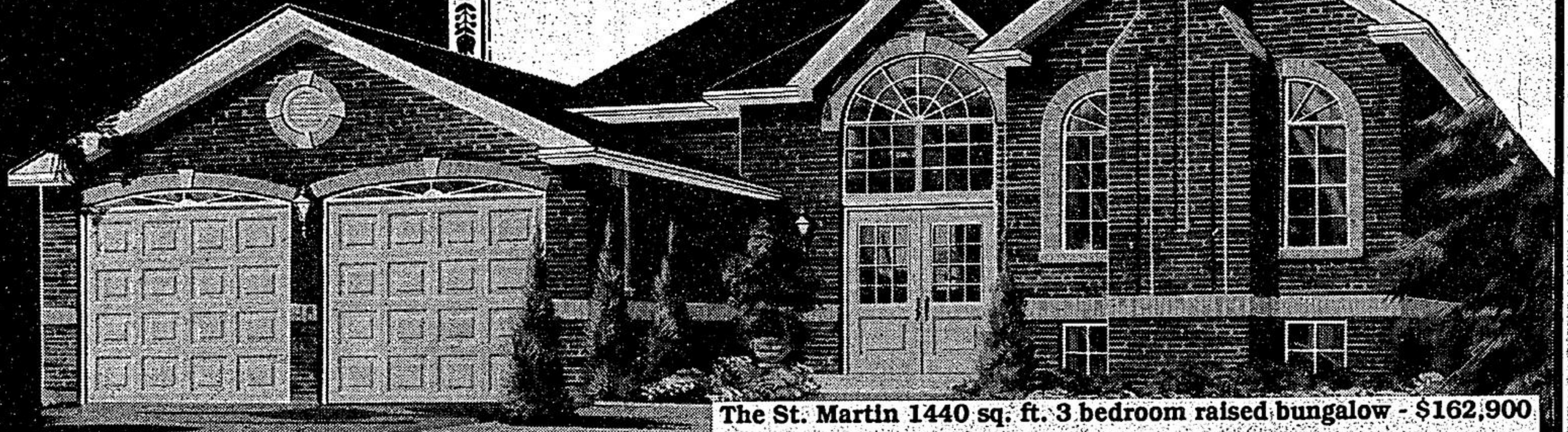
The St. Martin 1440 sq. ft. 3 bedroom raised bungalow - $162,900 Artists Concept. Prices and specifications are subject to change without notice E. & O. E.