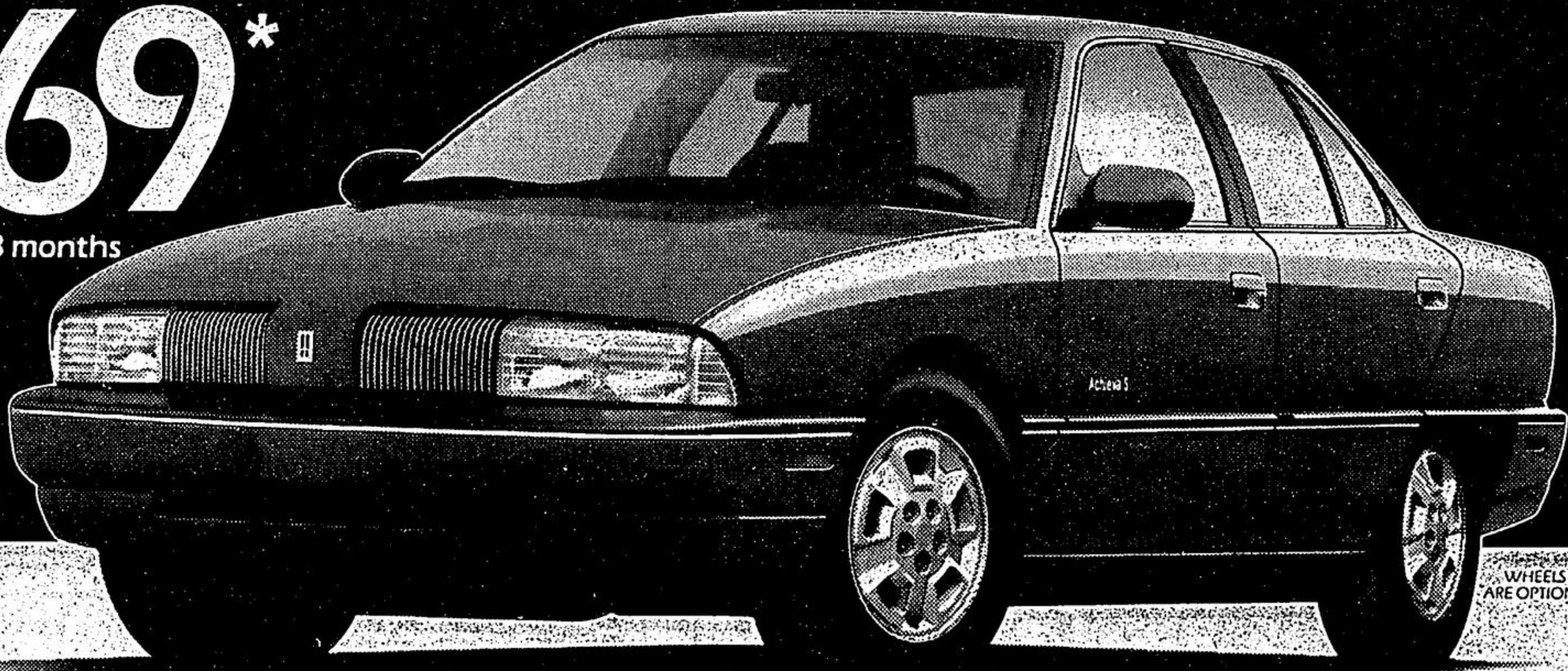
WHEELS SHOWN ARE OPTIONAL EXTRA