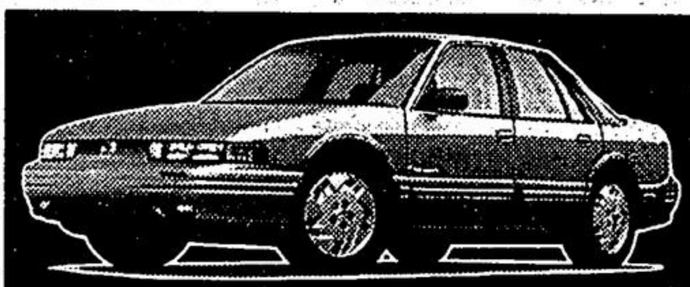
Oldsmobile Cutlass Supreme

SMARTLEASE $359* a month for 36 months OR ONLY $19,999†