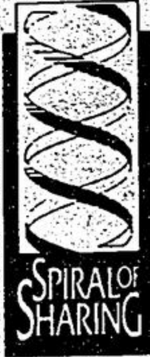
Markham Stouffville Hospital Foundation

Markham Stouffville Hospital Foundation c/o Nominating Committee 381 Church Street P.O. Box 1800 Markham, Ontario L3P 7P3