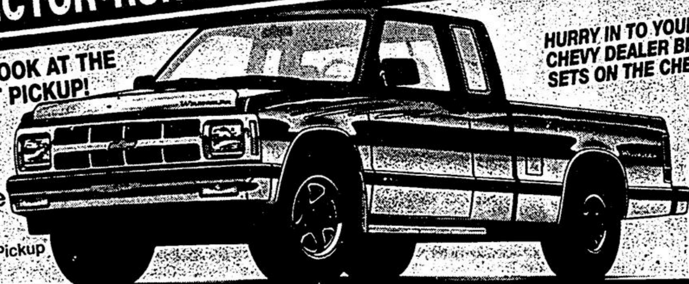
Chevy S/T Compact Pickup

HURRY IN TO YOUR PARTICIPATING CHEVY DEALER BEFORE THE SUN SETS ON THE CHEVY SHOWDOWN!