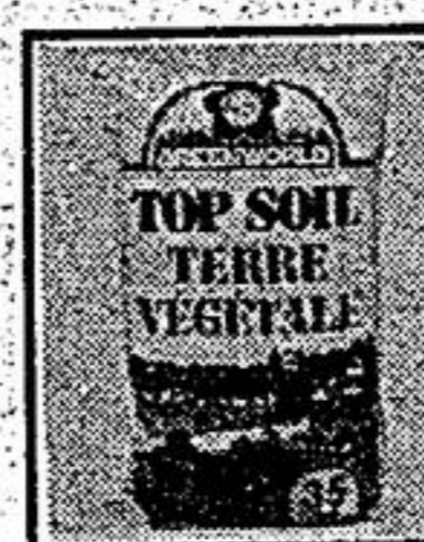
ASB TOPSOIL $2.49 35 LITRES