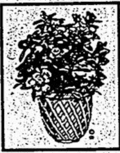
PATIO PLANTERS $9.99 12" CONTAINER