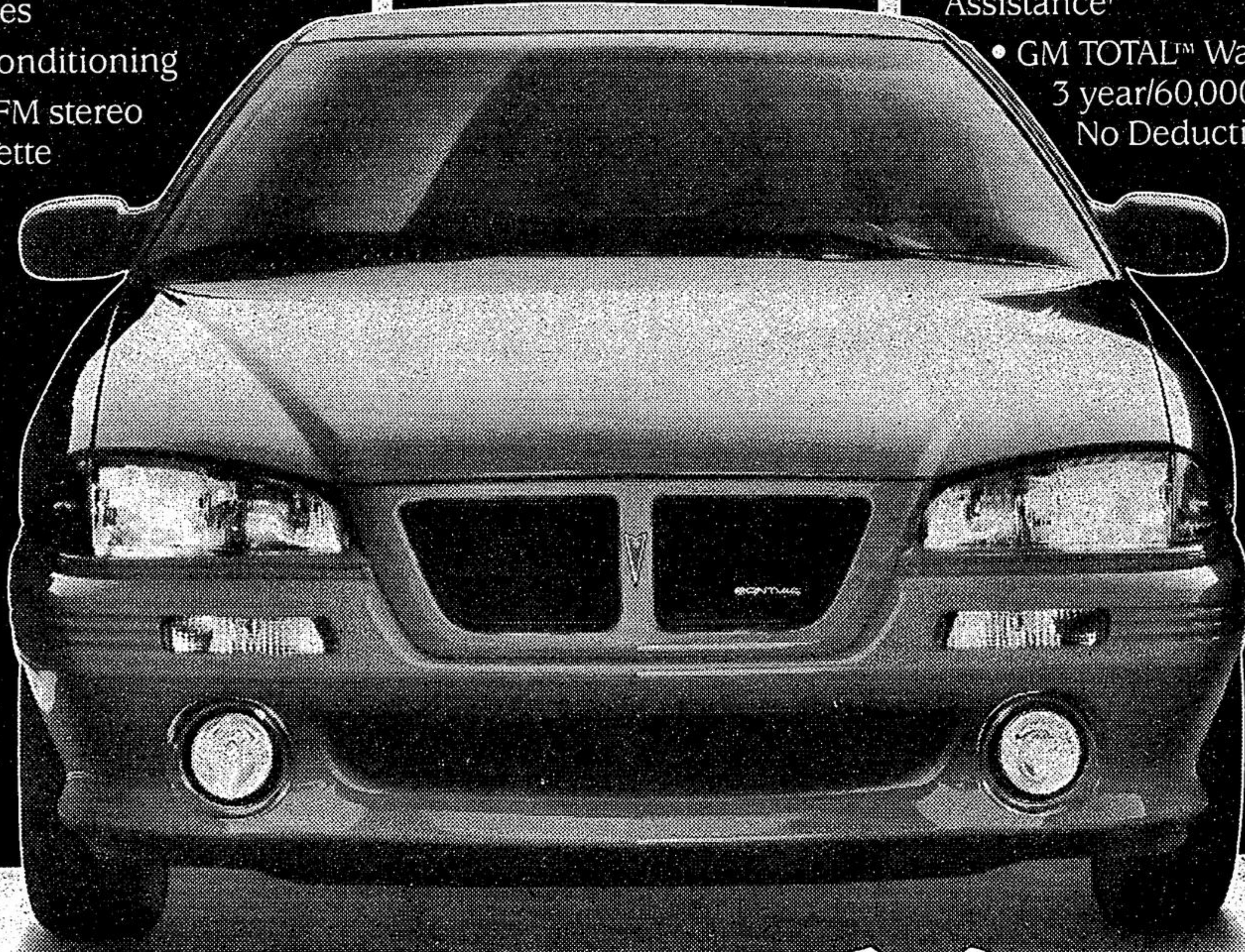
Pontiac Grand Am SE Sedan