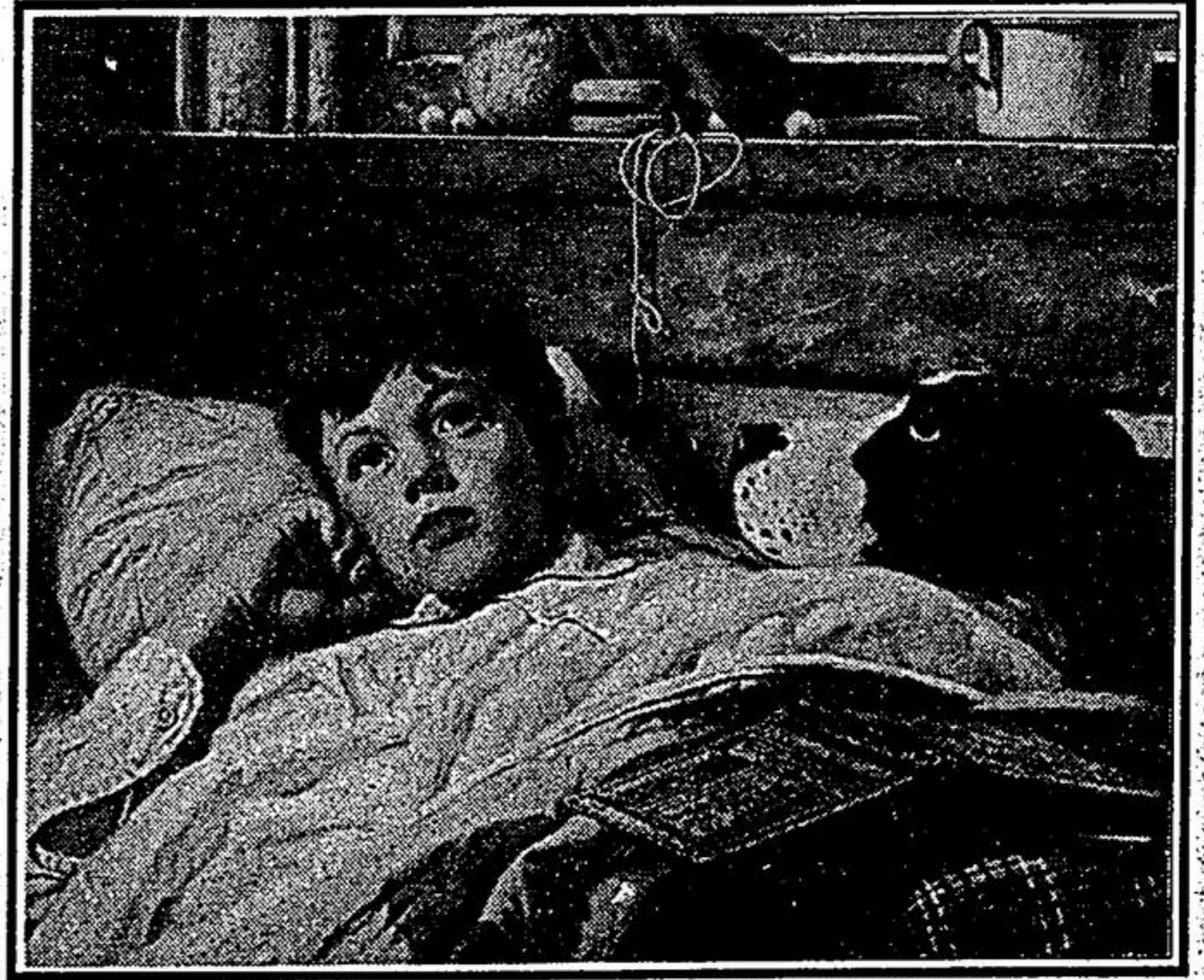
When I Grow Up (18 5/8" x 14 7/8")