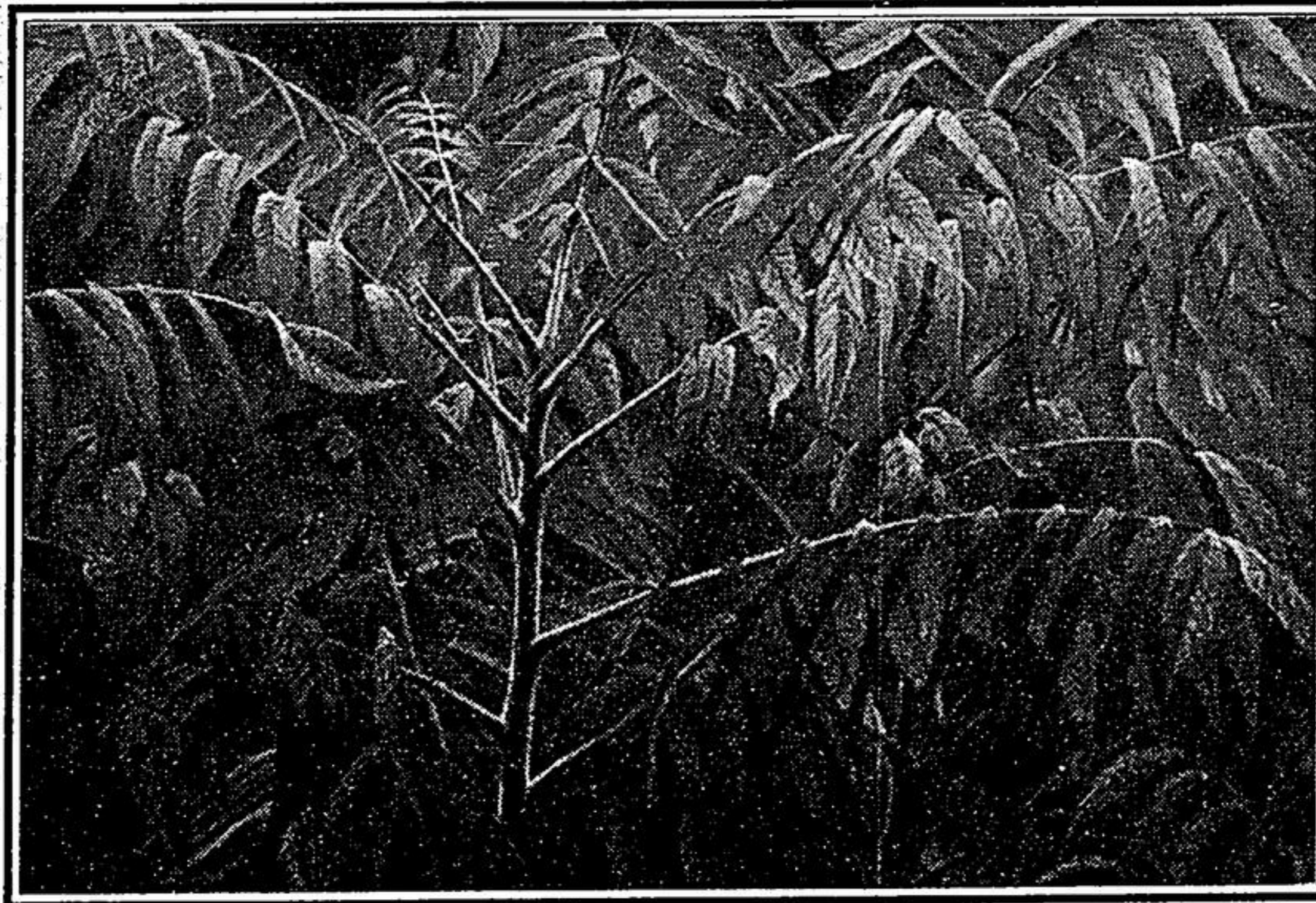
Cardinal and Sumac (13" x 19 1/2") FRAMED SPECIAL $399.00