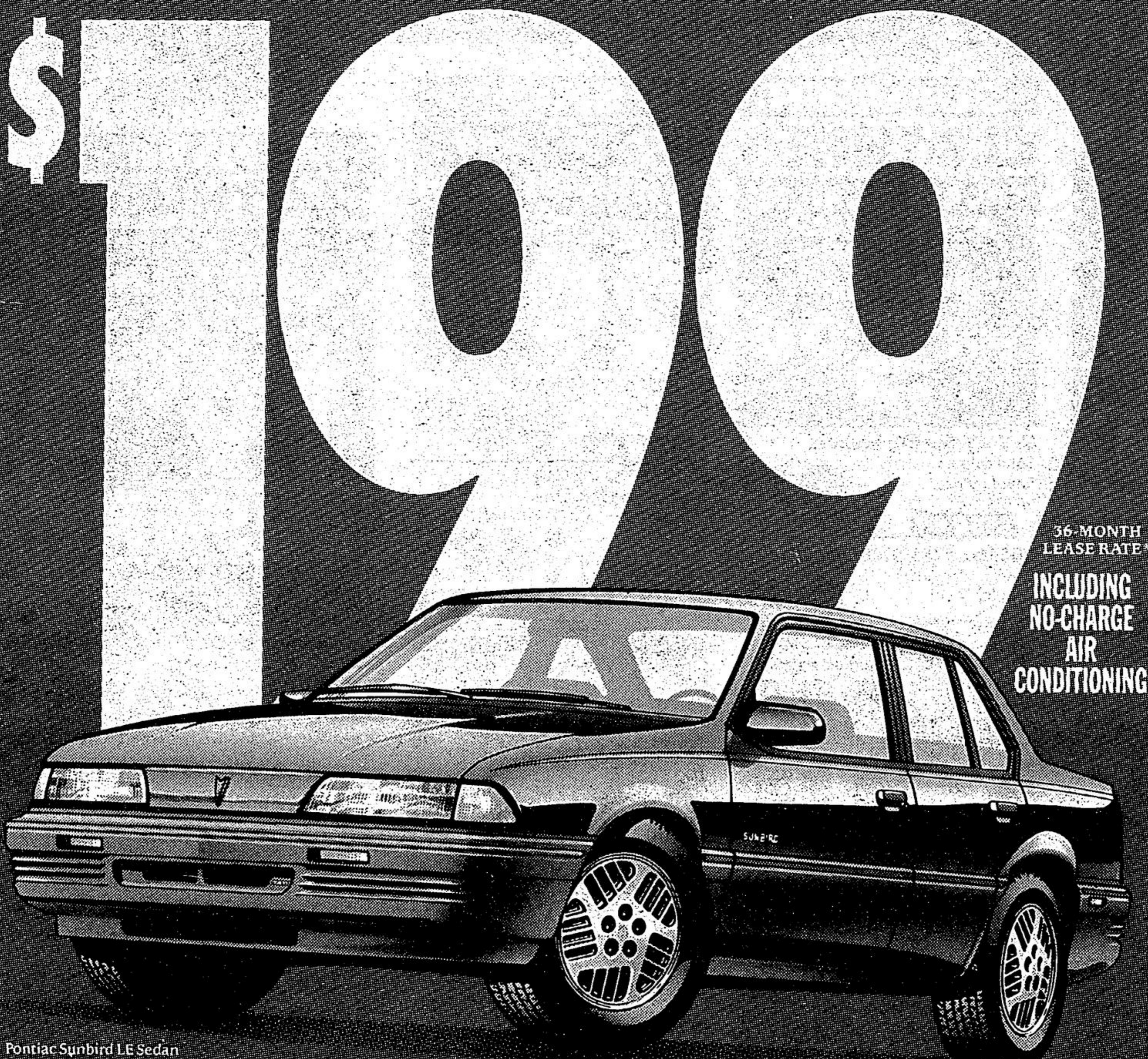
Pontiac Sunbird LE Sedan

Sunbird's crushing the competition with these features.