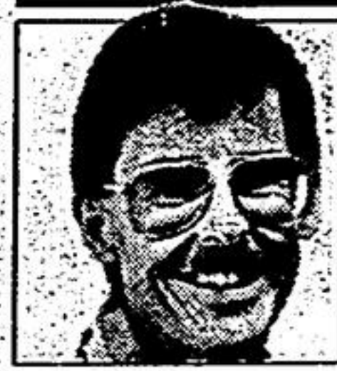
From Where I Live

And while the likable Uxbridge area resident has managed to upgrade his English vocabulary considerably since then, he has also held onto the memo-