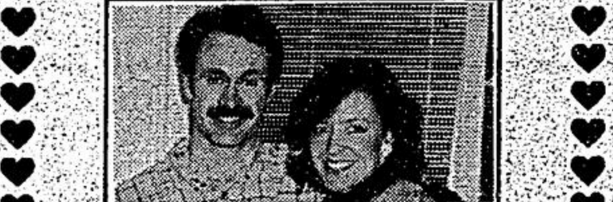
Love your families & friends