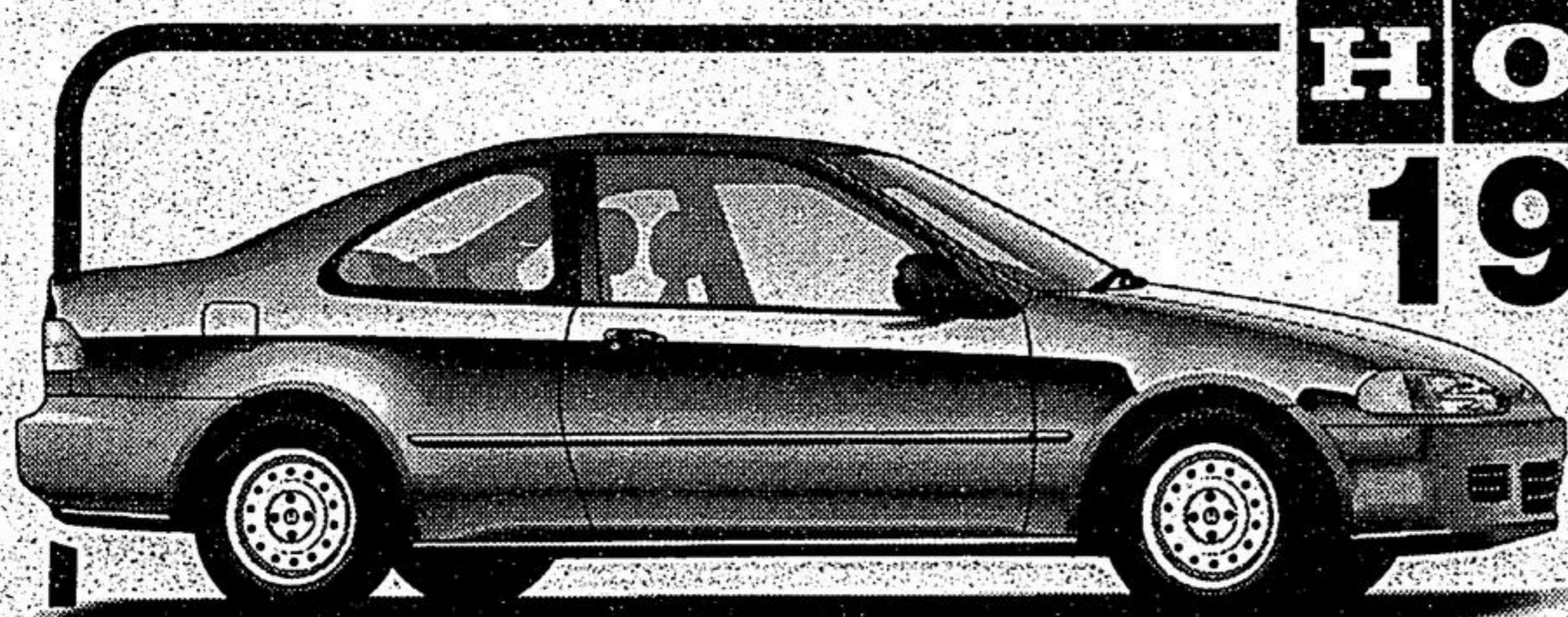
The New Civic Coupe