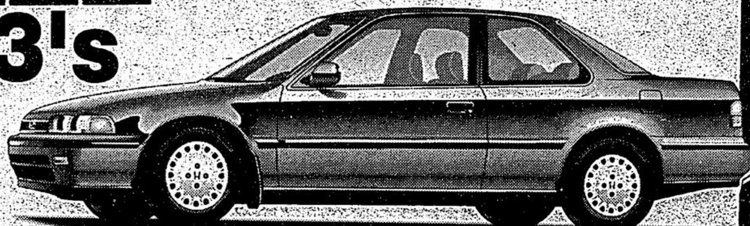
The Honda Accord