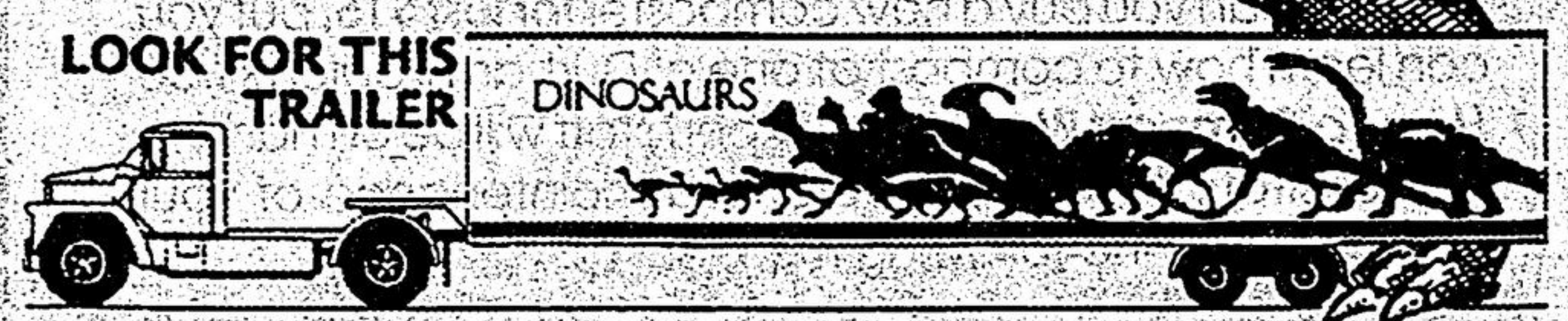
The Royal Ontario Museum gratefully acknowledges the generous support of Cadillac Fairview Corporation Limited and William Neilson Limited and their product, Cadbury Crunchie, in the development of the ROM'S DINOSAUR MUSEUM MOBILE. The Royal Ontario Museum is an agency of the Ministry of Culture, Tourism and Recreation.

Gallery Hours: Wed. to Fri. Noon-8pm Sat. 10am-5pm