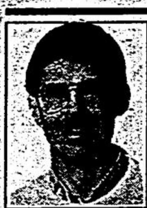
From Where I Live