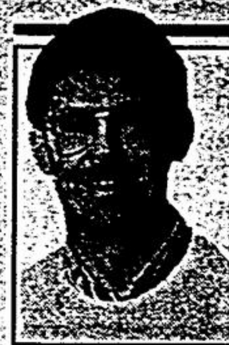
From Where I Live