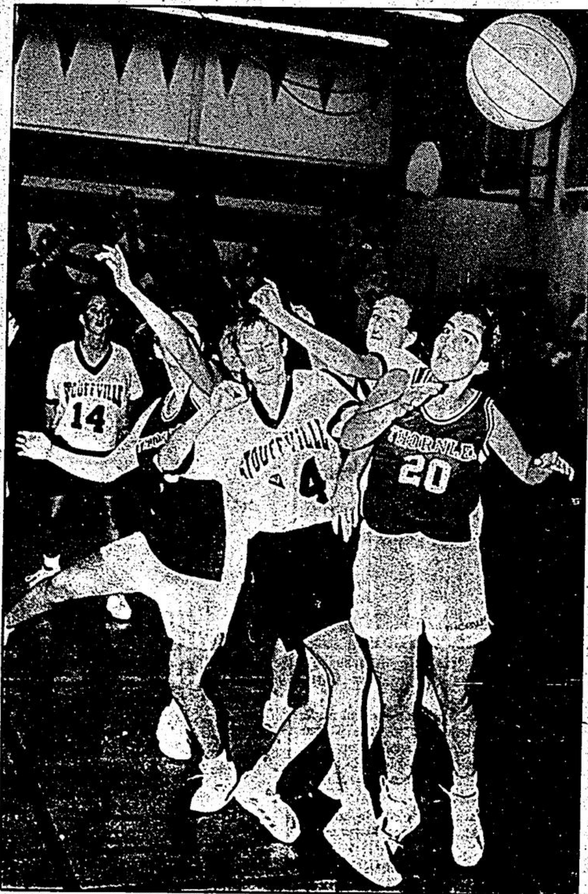
The SDSS girls basketball teams had great seasons last year, winning the midget, junior and senior York Region championships. The midgets went on to take the silver at the Durham-York's held at SDSS. Here, the junior team, white sweaters, is shown in action against Thornlea.

The major atom Clippers laid claim to the gold at a tournament held in Little Britain. The major novice Clippers took the gold at a tournament held in Little Britain. (Please see page 28)