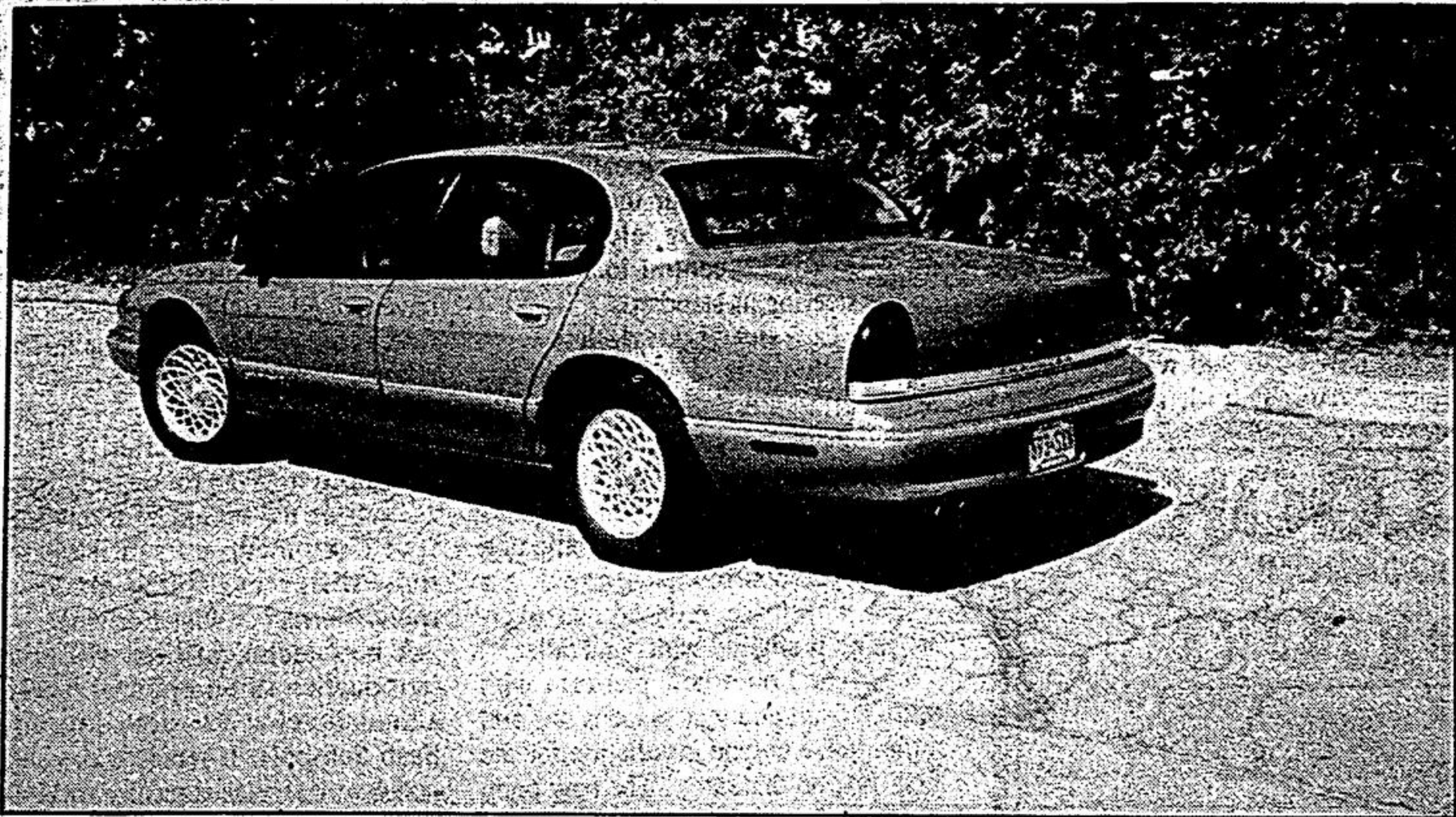
The 1994 Chrysler New Yorker LHS is almost six inches longer than the standard LH car which results in even more room for passengers in Chryco's flagship model.