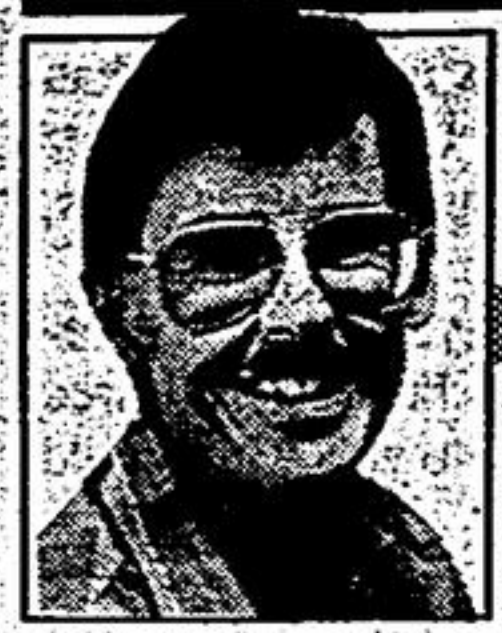
From Where I Live

meantime, he was trying to figure out how he could get through to provincial Tory leader Mike Harris. He wanted to congratulate him for jumping all over the Queen's Park decree censuring a tradition that has been with us ever since the first load of immigrants settled here some 400 or