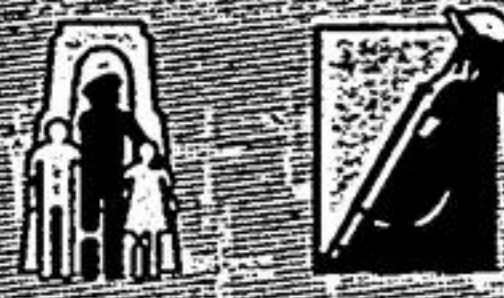
The War Amps

"In a war, everyone suffers... we must never let it happen again."