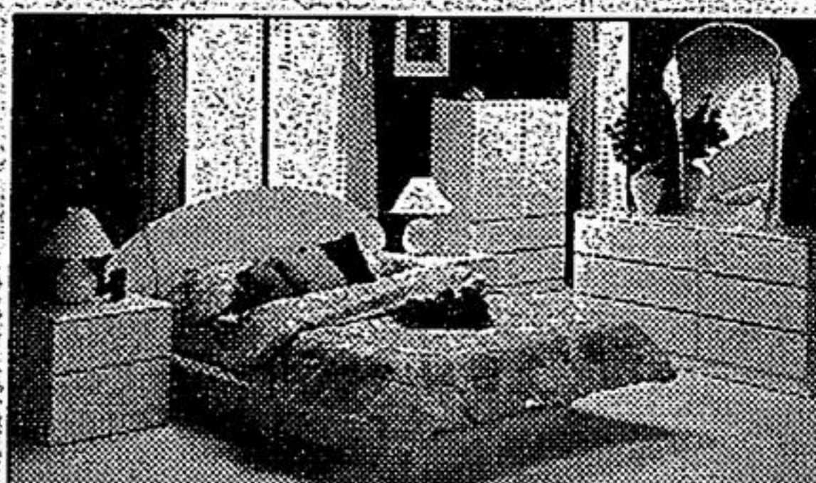
Mirage Bedroom Dresser, mirror, headboard and 2 night tables. Also available in black. Chest or platform optional. $998

NOT JUST BETTER PRICES, BUT BETTER QUALITY FURNITURE!