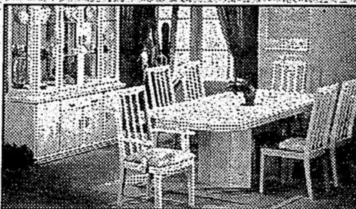
Tiffany 9 pc. Diningroom Buffet, hutch, pedestal table, 4 side chairs, 2 arm chairs. Elegant bleach finish. $2598