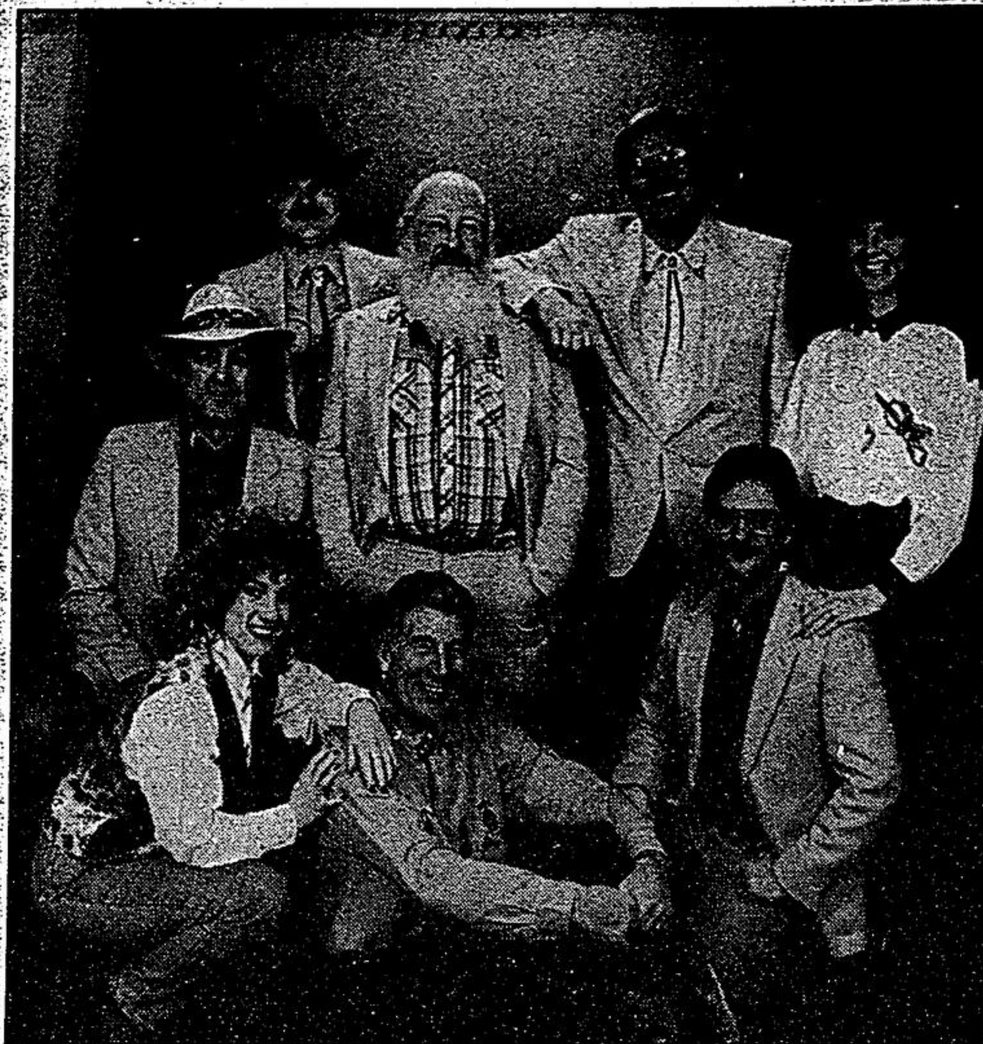
Crabgrass performs at Markham Fairgrounds dance next Saturday.

THE TORONTO STAR The shape of news to come