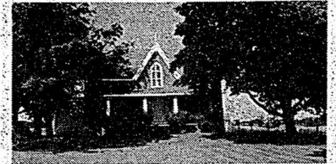
UXBRIDGE 83 ACRE FARM $385,000

Surrounded by farms; this sweet 2+1 bedroom with original hardwood, eat-in kit., out buildings & more. Call Mary Lynne MacVicar*, 852-9781 or 649-2231.