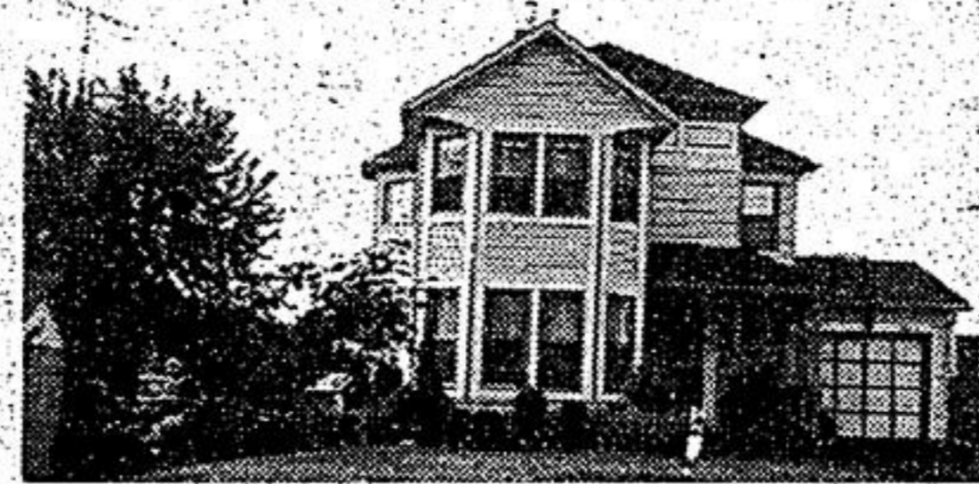
PORT PERRY VICTORIAN VILLAGE

3 bedroom home set on a partially treed lot, eat-in kitchen with walkout to large deck, separate dining room, 4 pc. & 3 pc. baths. Partially finished basement with entrance to two car garage. Cute and cozy! Listed at $263,000. Please call 985-9777.