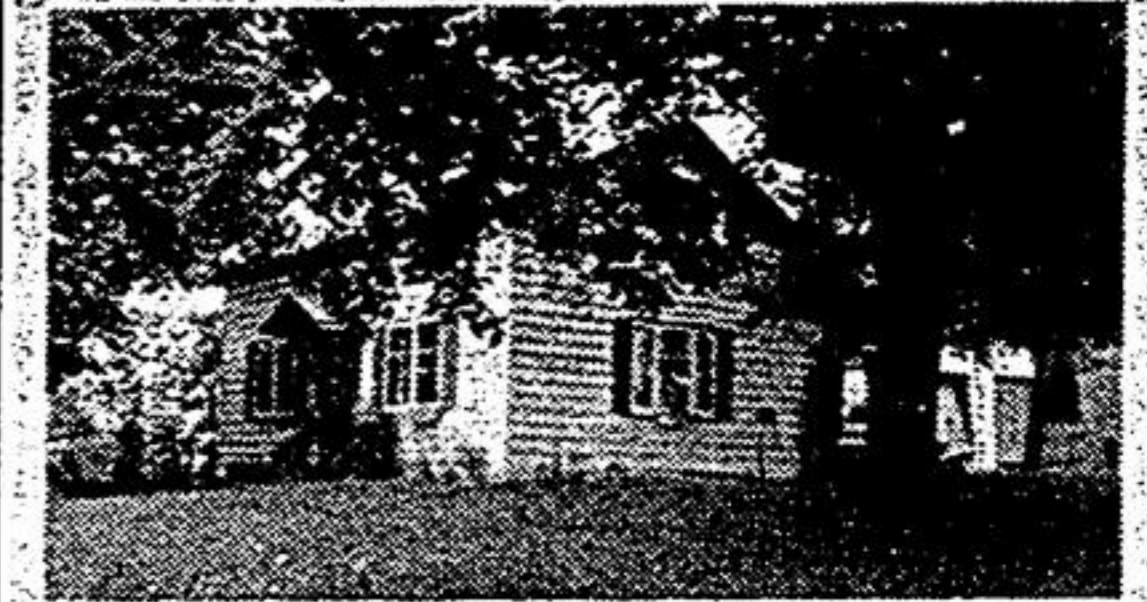
ZEPHYR / MT. ALBERT AREA $129,000

Surrounded by farms; this sweet 2+1 bedroom with original hardwood, eat-in kit., out buildings & more. Call Mary Lynne MacVicar*, 852-9781 or 649-2231.