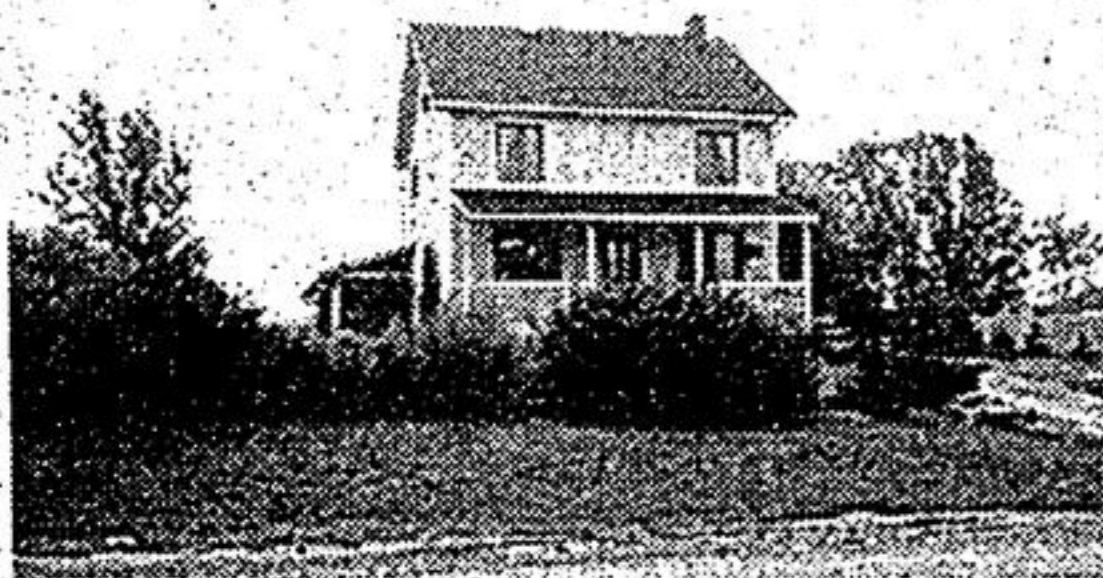
FULLY RENOVATED - NEWMARKET - $229,000.

1/2 acre plus property. 6 bedrooms, treed & prof. landscaped, large drive & double/double garage with loft. Pine floors & kit. cabinetry.