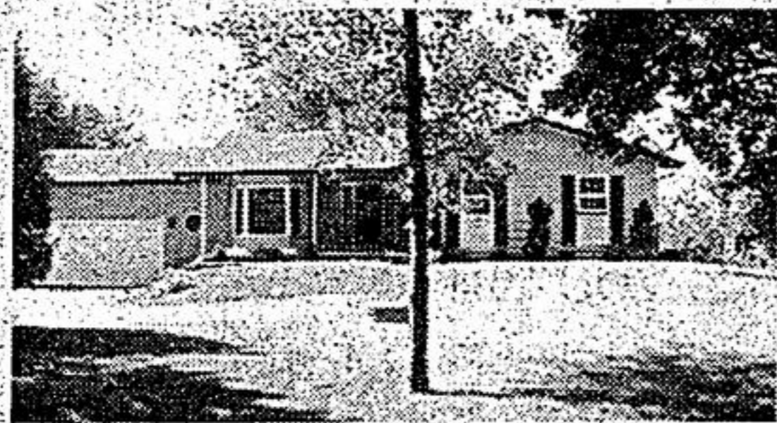
CASTLE HARBOUR BUNGALOW

Member Oshawa & District Real Estate Board Member Lindsay & District Real Estate Board CALL TOLL FREE 1-800-267-6177