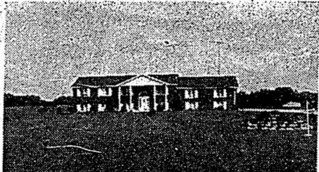
PLEASE CHECK YOUR NEEDS

Access to Lake Scugog. 4 bedroom raised bungalow. Large oak eat-in kitchen, family room with airtight. Dining room with walkout to deck, verandah and pool. 2 bathrooms, large sunroom 20' x 20'. Over one acre lot. Check this for value $299,000. Must be seen for appreciation.