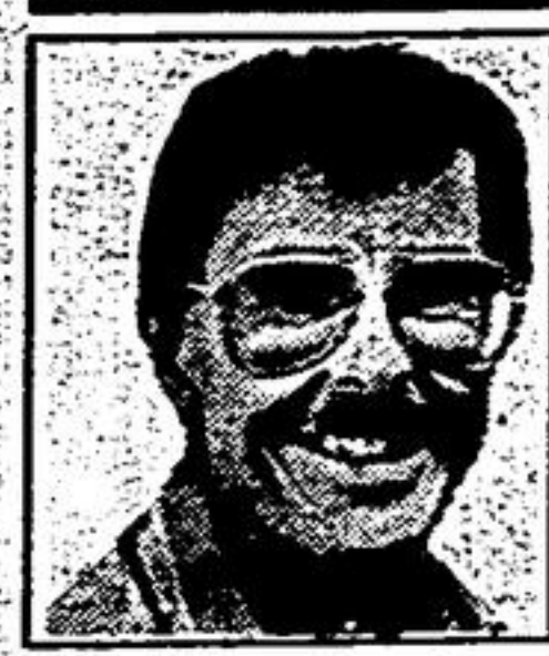
From Where I Live

His shoes don't match, his pants are about four inches too short, and his trusty broom, which rests across the