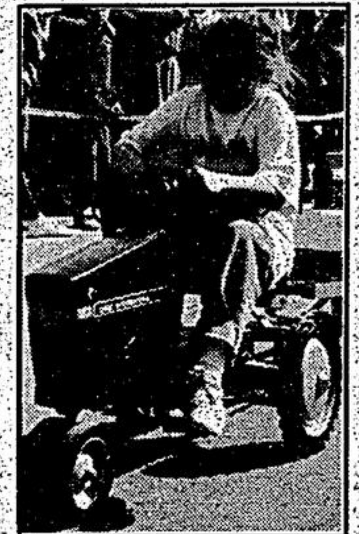
Children's Pedal Tractor Pull