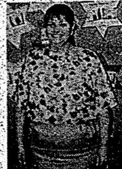
Connie Coll of our Whitby Clinic has lost 69 1/2 lbs. & 7 1/2 inches.