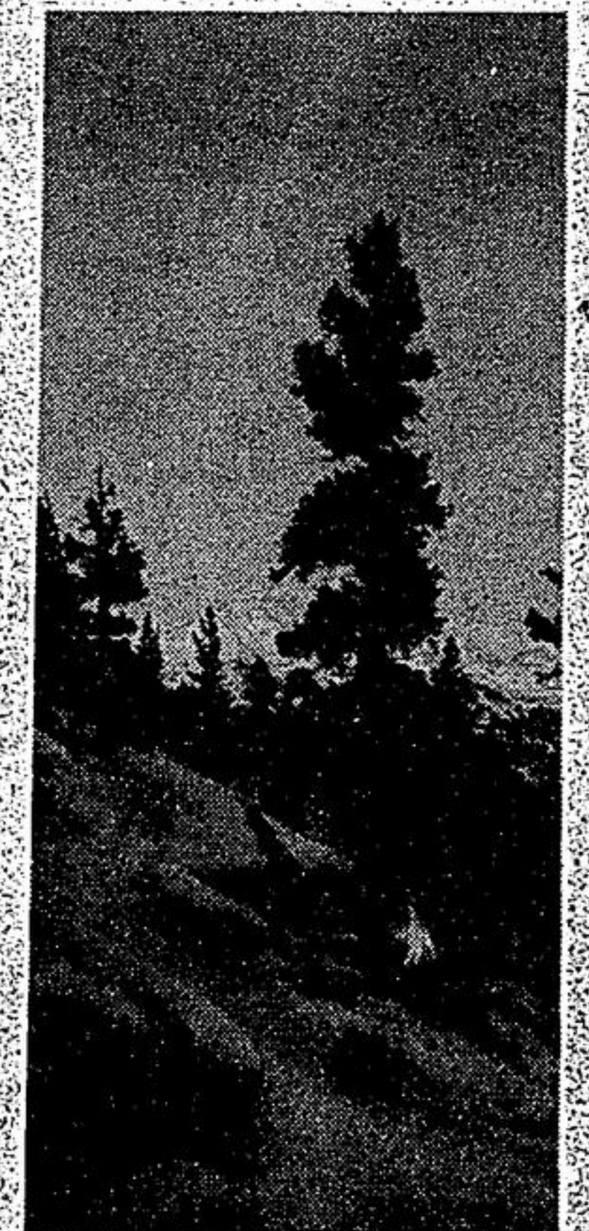
The Art of Stephen Lyman: Fire Dance.

A limited edition fine art print. $305 Stephen Lyman actively seeks to capture glorious, elusive, special moments when light infuses nature. The results are such breath-catching images as this one, Fire Dance - the fourth in a series of campfires, all sold out at the publisher. Fire Dance is available only through authorized Greenwich Workshop dealers; please visit or call our gallery for more information.