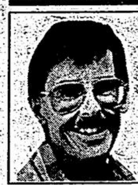
From Where I Live