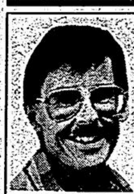
From Where I Live

These people's lives are all a little fuller these days as a result of a couple of golf tournaments run as charity fundraisers by National Hockey League players. With this general area featuring an abun-