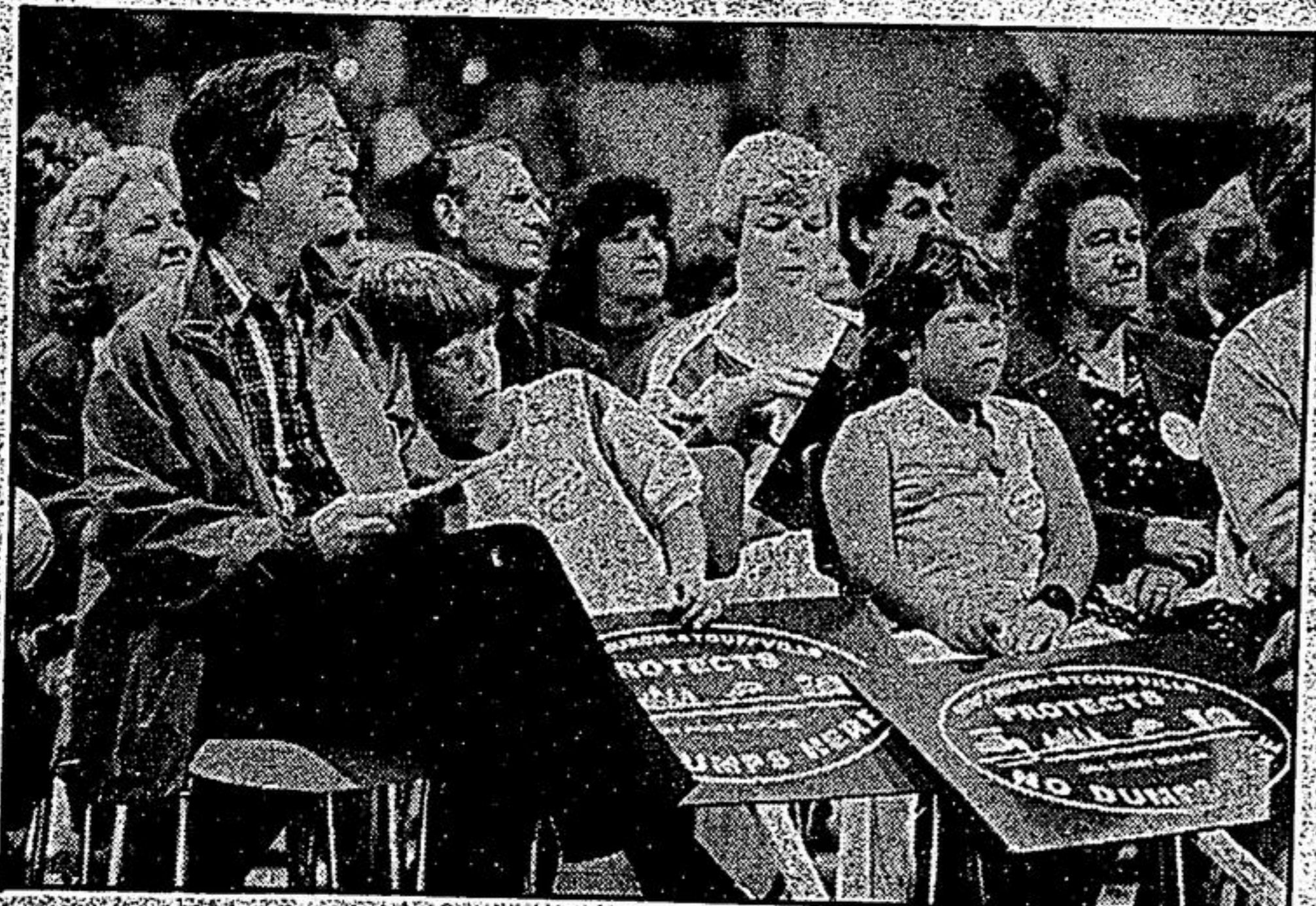
Residents rallied to fight the dumps.

Council votes unanimously in favor of initiating a 325 acre industrial park in Gormley.