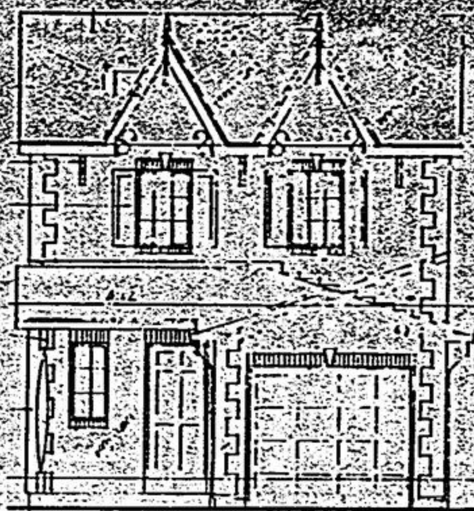
1485 sq. ft.

All Brick Walk-out basements included. Beautiful Mature Trees Walking Distance to Main St. Sports facilities, Hospitals, Schools & Shopping