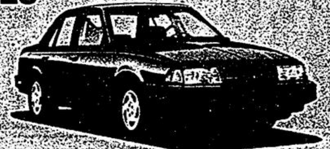
CORSICA 4 Cyl. Models Only