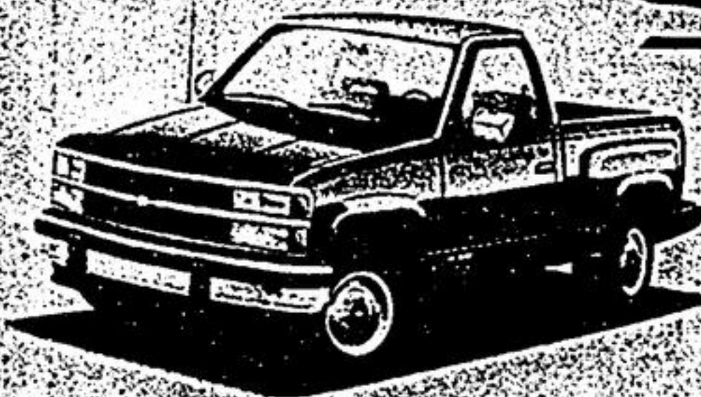
CK REGULAR CAB PICK UP