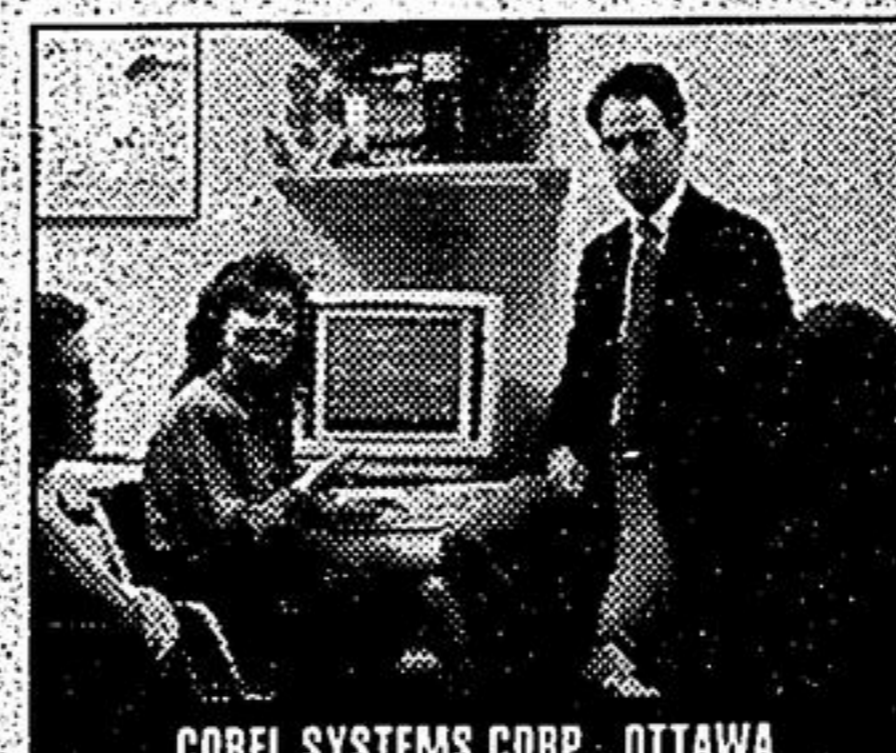
COREL SYSTEMS CORP., OTTAWA

Send registration to: 602 Rupert Ave., Stouffville, Ont. L4A 1W1