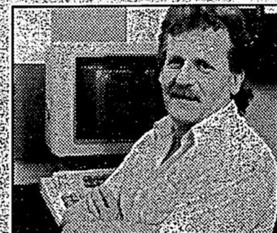
FREEWILL SAUNDERS, BRITISH COLUMBIA

We have a history of working in co-operation with others for world-class achievements in peacekeeping, medicine and space exploration. Now, with business, labour, governments, academic and social groups working together, we can achieve prosperity through international competitiveness. But there is one more critical factor: Canada's ultimate potential depends on the commitment of individual Canadians to being the best.