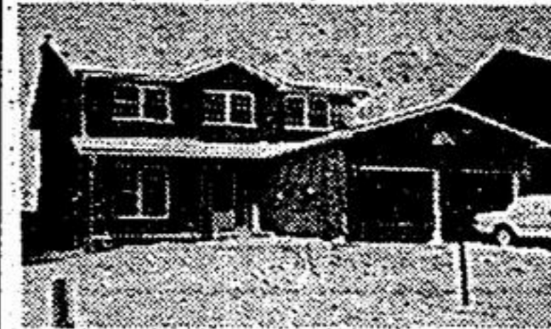
30 Ivy Cresc. Stouffville