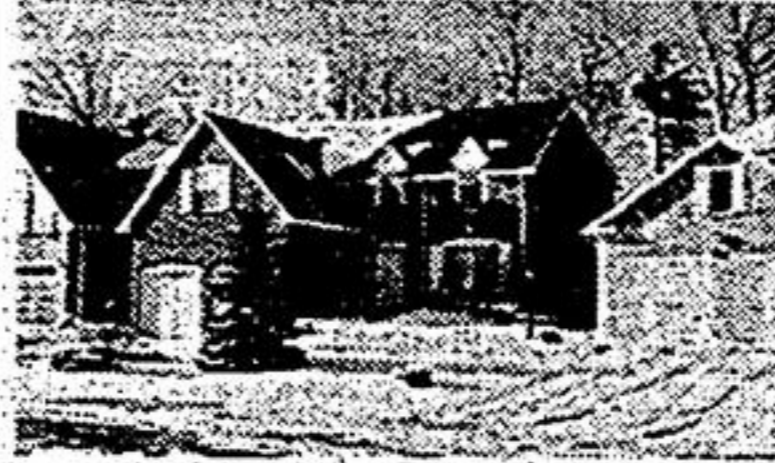
18 McPhail Cr. Unionville