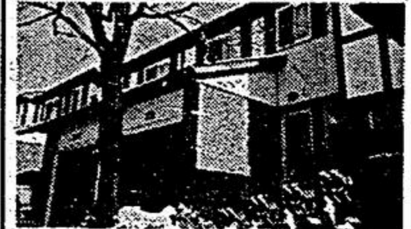
7 Thatchers Markham

THE SPRING MARKET IS IN FULL BLOOM! BUYING OR SELLING YOU WIN!