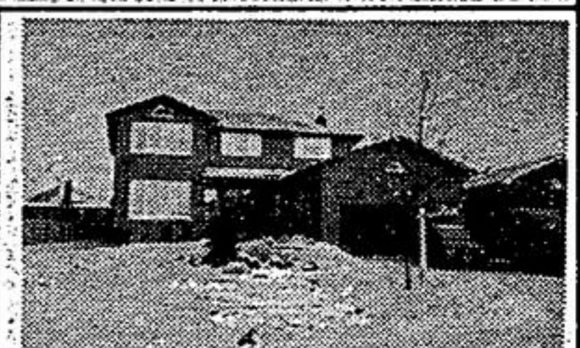
NEW PRICE $299,000