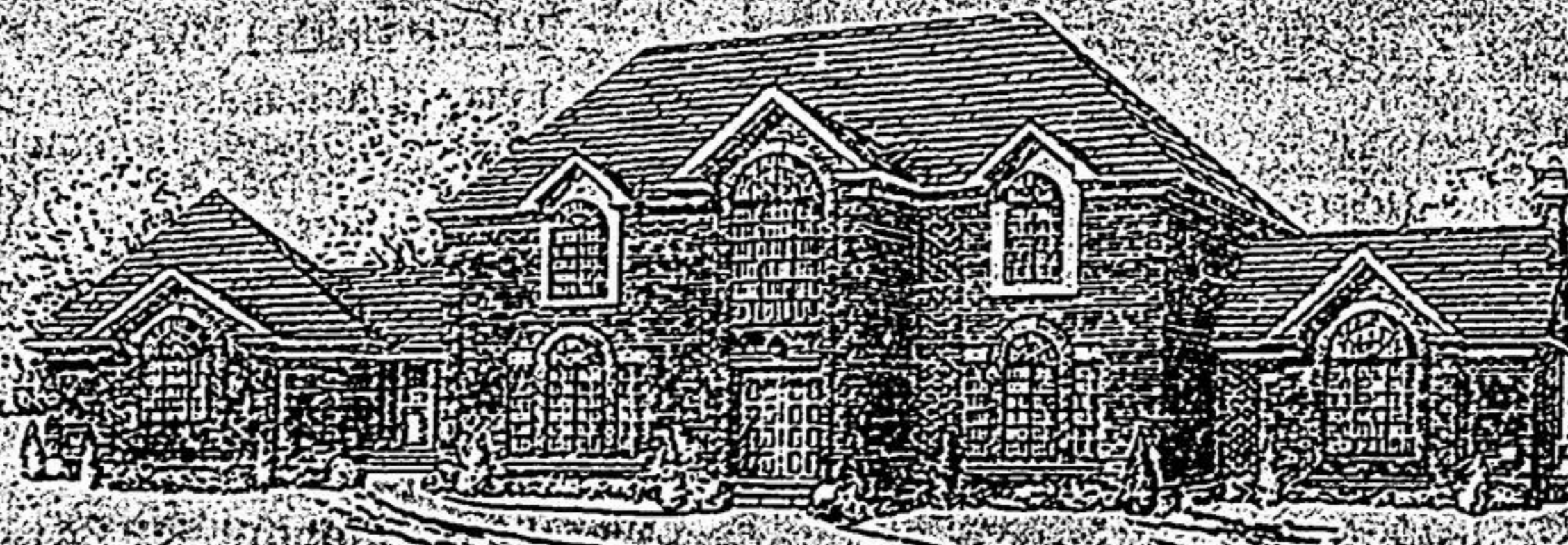
The Hogan 3800 sq. ft. $479,900