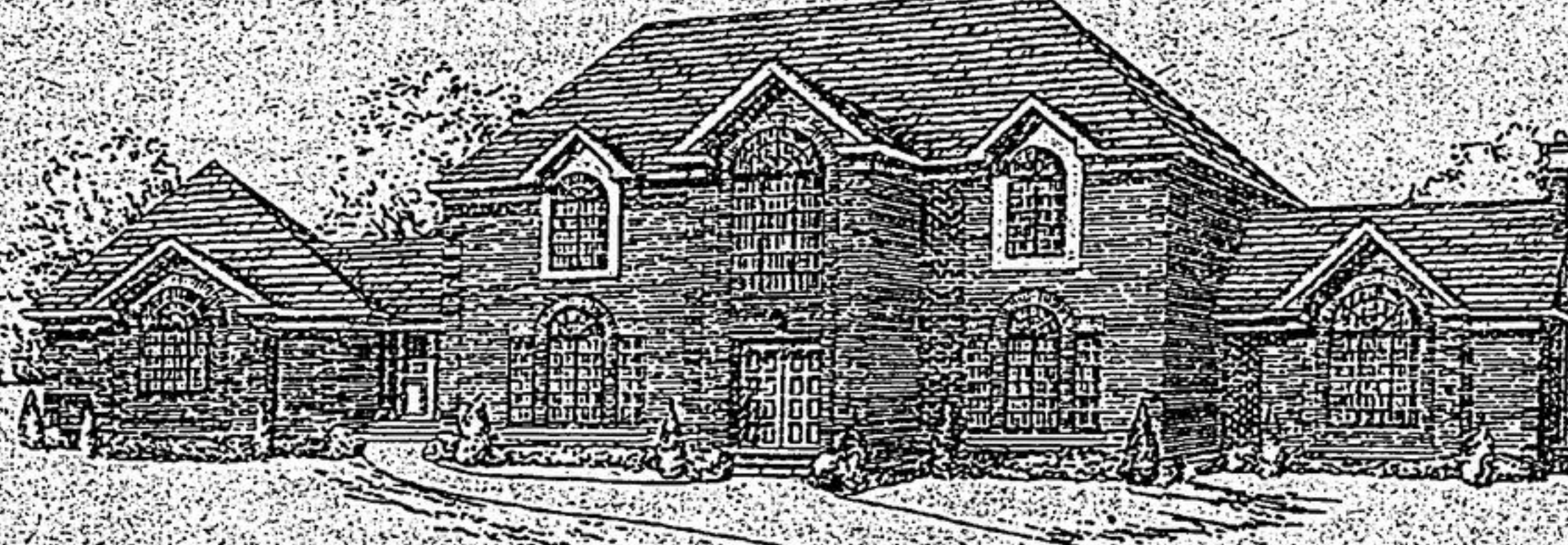
The Hogan 3800 sq. ft. $479,900