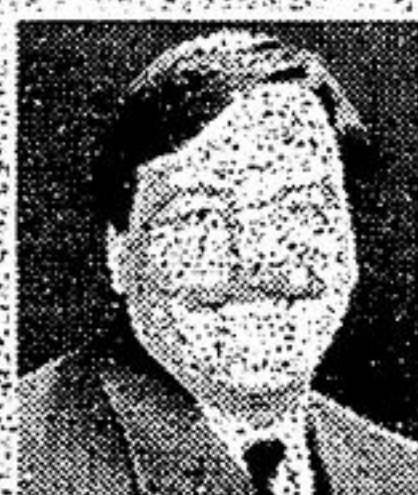
JOHN HUDDART* 852-9665

GET READY FOR SUMMER! 3 bdrm. brick home features large private backyard with inground pool. Tree-lined street. Close to amenities in Uxbridge. Super kitchen, cozy rec. rm. $199,000. Jim Wood*, 852-6143.