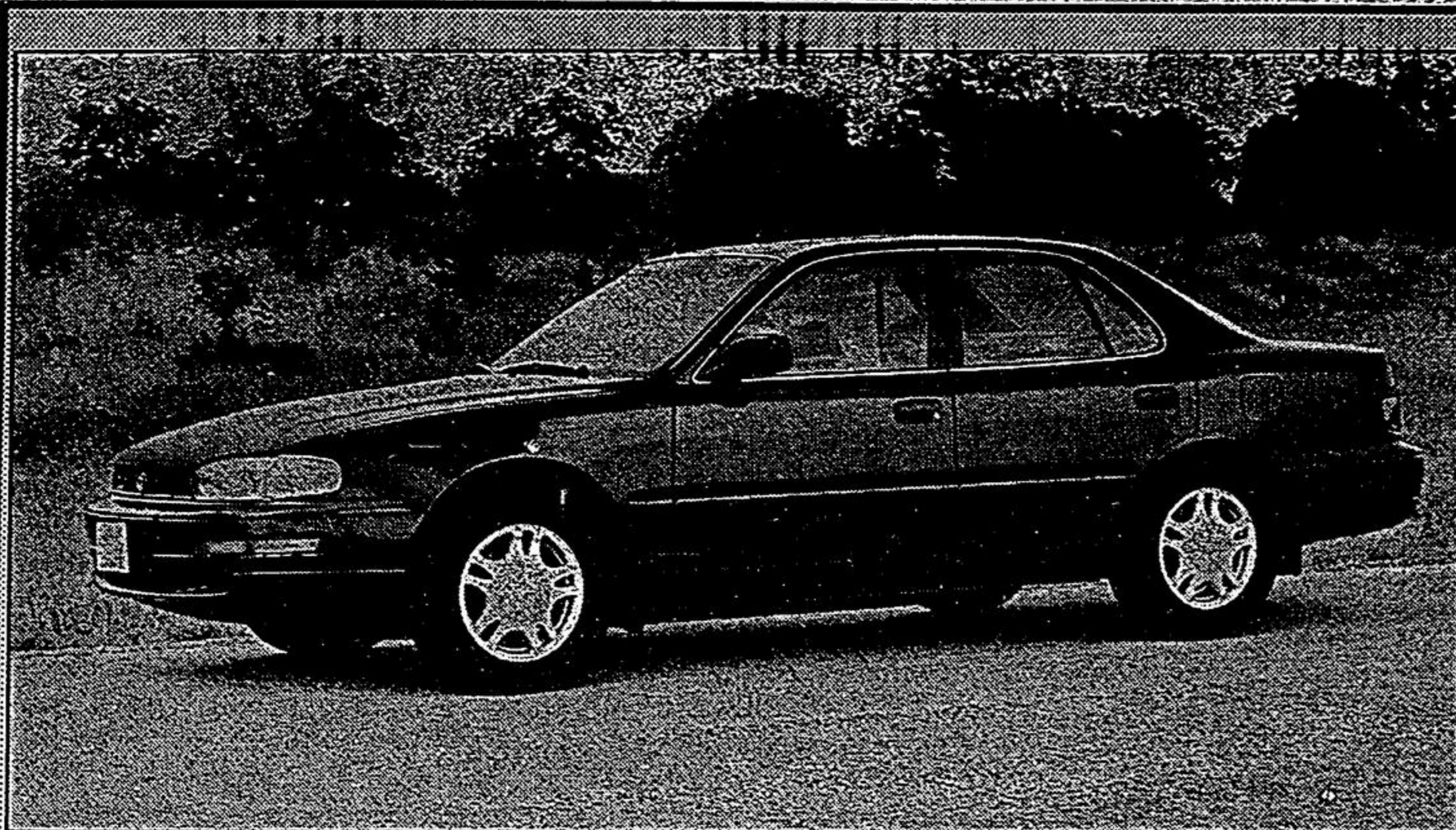
1992 TOYOTA CAMRY SEDAN: Quieter, more spacious and more comfortable, totally re-engineered and re-designed for 1992, the front wheel drive Camry is available with either an all new 2.2 litre 16 valve/twincam four cylinder engine producing 130 horsepower or a 24 valve/quadcam V6 engine producing 185 horsepower. Available in two levels, the '92 Camry features a standard driver-side airbag Supplemental Restraint System (SRS) and optional ABS (Antilock Braking System). The Camry is available with either a five speed overdrive manual or a four speed overdrive automatic transmission.