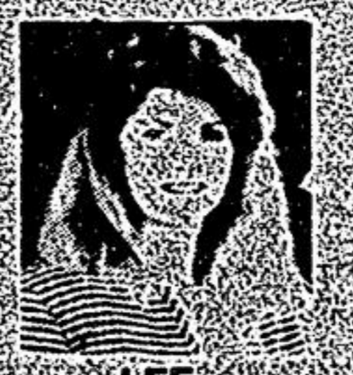
LEE WELDON** 510-1284