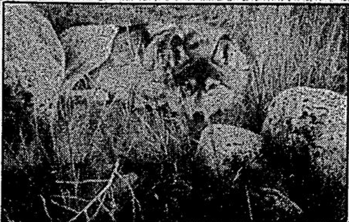
"One to One - Gray wolf"

by Carl Brenders size 21 1/4 x 27 1/8 Framed reg. price $620 Reg. Print $365 Special framed $488