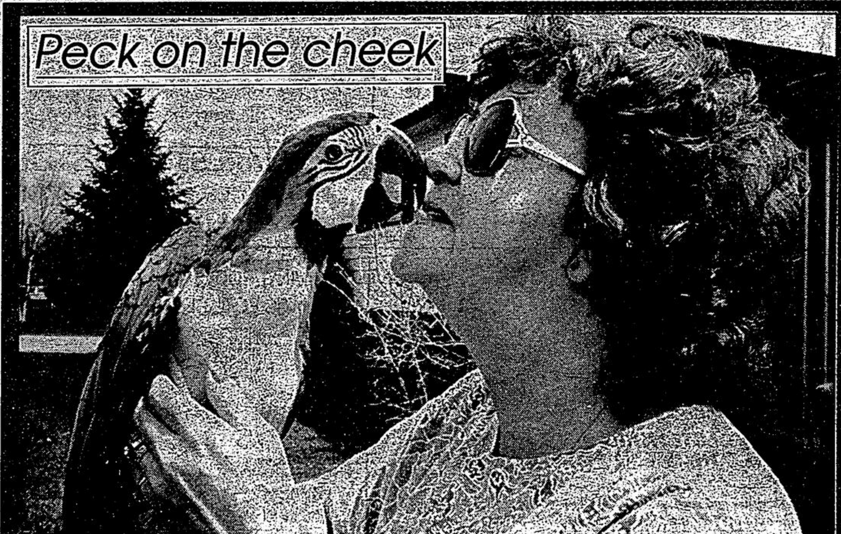
Peck on the cheek

There were no charges laid in the mishap.