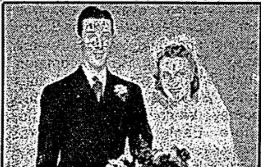
Married: March 7, 1941