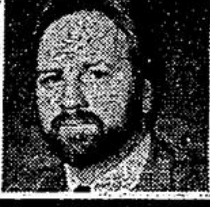
Kevin M. Howard

IN TOWN HOME ON 100' X 200' LOT Raised bungalow with 4 bedroom, 2 bathroom, 2 fireplaces, open concept for $179,000.