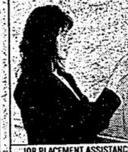
JOB PLACEMENT ASSISTANCE