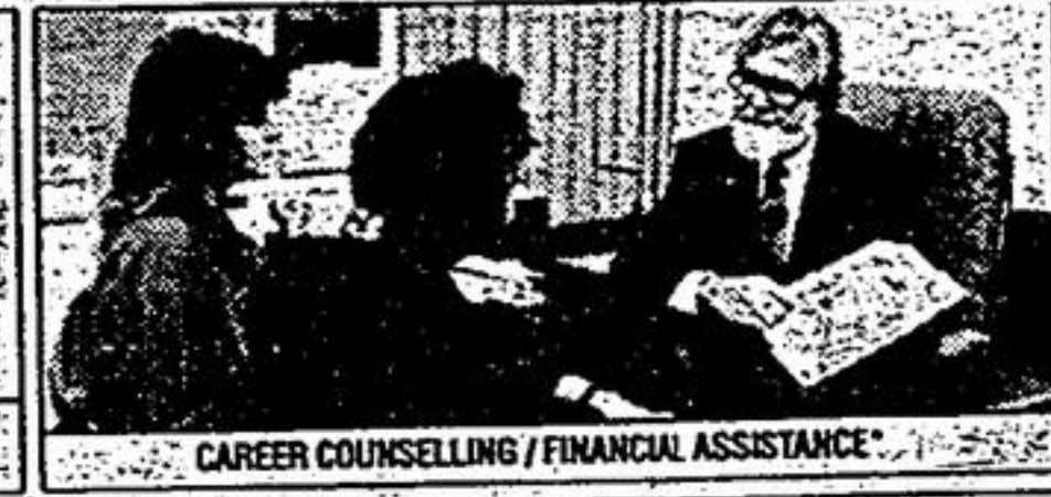
CAREER COUNSELLING / FINANCIAL ASSISTANCE