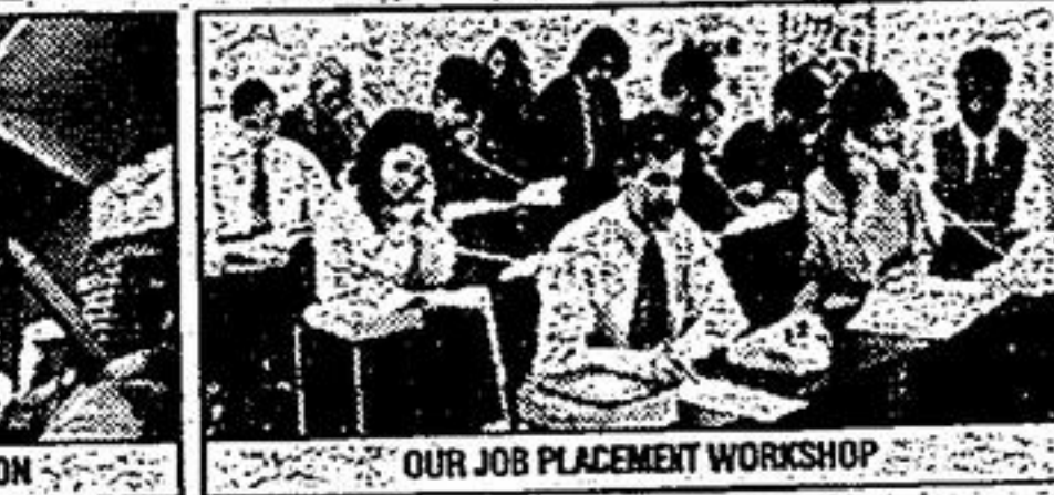
OUR JOB PLACEMENT WORKSHOP