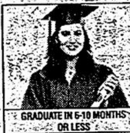
GRADUATE IN 6-10 MONTHS OR LESS

At The Toronto School of Business, we specialize in training people for business and computer-related careers. We not only prepare people for the kind of job they want... we also help them get it. We're proud to have prepared tens of thousands of men and women for satisfying, successful careers. We can do the same for you!