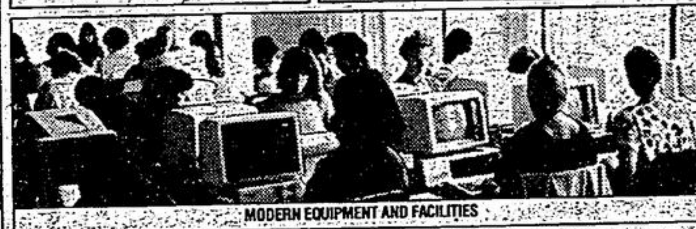
MODERN EQUIPMENT AND FACILITIES

Not all courses available at all campuses. Morning, afternoon, evening or Saturday classes. Free lifetime job placement assistance. Financial assistance may be available to qualified students.